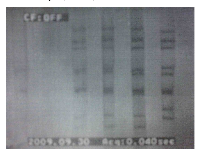
Figure 2. Demonestration of the electrophoretypes of rotavirus in children with NRVI admitted to Bahrami children Hospital, Tehran, Iran.