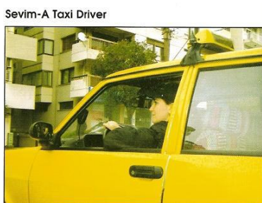
Figure 5. Women at men's work ( New Bridge to Success )