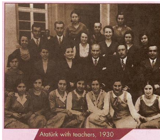
Fig 3. Images of women as teachers ( Spotlight on English )

In contrast to males, females are mostly portrayed in subordinate roles. Nevertheless, some passages and visuals project positive images of women with whom female students can identify themselves (Figures 3, 4 and 5).