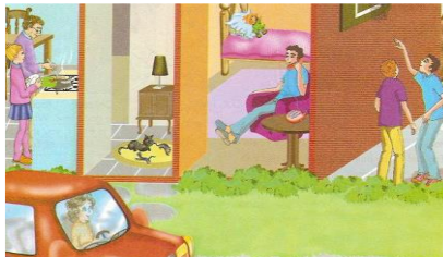
Figure 4. Men and women around the house ( Spotlight on English )