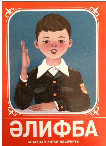
A Tatar ABC book in Cyrillic script from Tatarstan, used for Tatar language education in Estonia

The following decades brought several new challenges to the community. The most important was maybe that the number of Tatars in Estonia decreased. According to the national censuses the numbers fell from more than 4,000 at the end of the Soviet era to 2,582 in 2000 and to 1,993 in 2011. Tatar cultural societies, very active in the 1990s in Tallinn, Narva, Kohtla-Järve and Maardu, are today struggling to survive as they lack both financial support and enthusiastic young volunteers. The older and formerly active members of the societies observe less interest in communal activities among the younger generations.