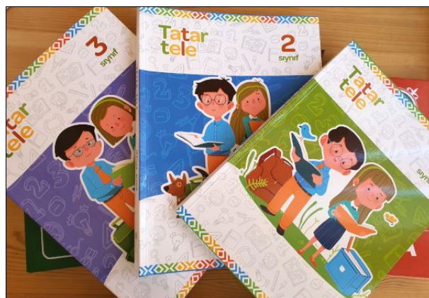
Modern books for Tatar language teaching in Latin script

Apparently the historical background of the immigration waves affect the way the Tatars in Estonia today are able to and want to teach their children about traditions and language. First were those of the 1700s and 1800s, who established a Tatar- and an Estonian-speaking community. The post-war Soviet waves of the 1940s and 1970s (the latter for supplementing the work force for the 1980 Moscow Olympic Games facilities in Tallinn) introduced Russian-speaking Tatars, and finally, after the collapse of the Soviet Union a decisive decrease and ageing of the community can be observed.