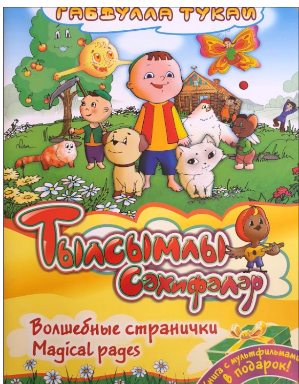
A modern version of the Tatar poet Abdulla Tukay's most popular poems, including Tatar, Russian and English

They are the first generation [of Tatars in Estonia] and their descendants and those in Finland have also retained their religion and language until today. They preserve the Tatar language well. Then the new generation, those who came during the Soviet era... their children don't speak Tatar any longer. Those who came from Russia can't make it [use the language] anymore.