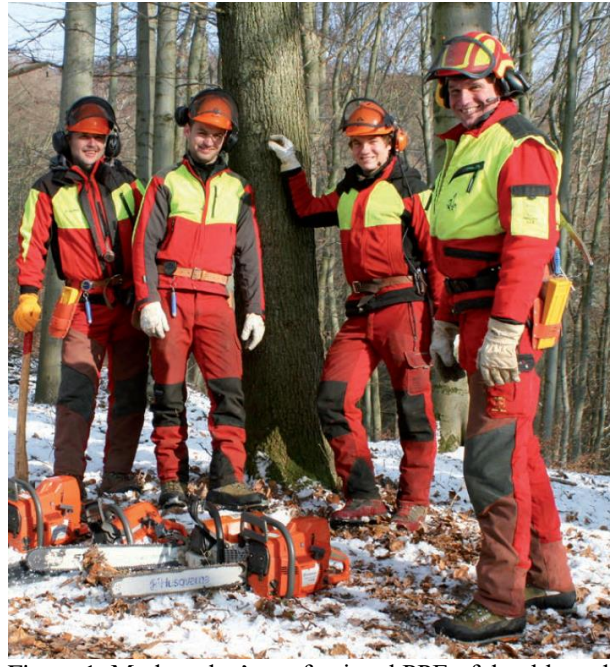
Figure 1. Modern day's professional PPE of durable and highly visible technical fabrics, with cut and weather protection, as well as high wearing comfort and modern communication devices such as earmuff integrated radios

Clear communication among forestry workers is a fundamental requirement for accident prevention, and to avoid log devaluation through felling damages caused by miscommunication within a felling team. Therefore, two-way radio headsets, integrated in the earmuffs of professional forestry helmets have become mandatory during motor-manual felling operations in many state forest enterprises, and are often combined with automatic emergency call systems (Schmidt-Baum, 2008). The latest generation make use of Bluetooth connections, avoiding the wiring beneath the work gear, further increasing work comfort, and thus performance efficiency (Höllerl, 2017b).