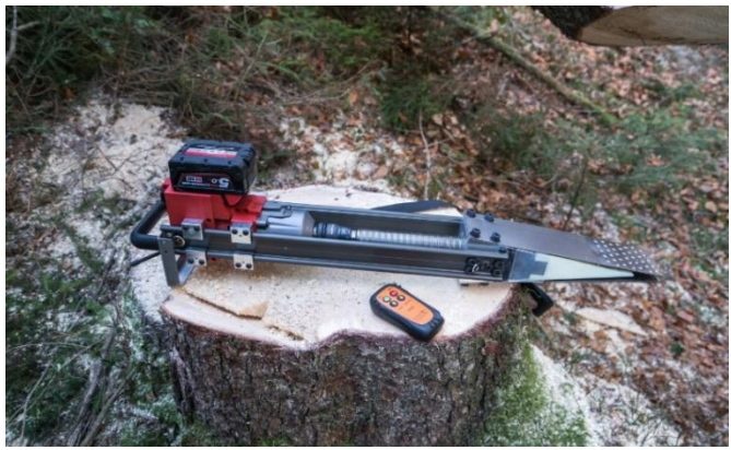
Figure 2. Remote controlled felling wedge Forstreich TR300

by the company Forstreich GmbH, fits a remote control on these wedges. This approach leads to the positive effects that a lower human force application is required, and that the forest worker can already retreat fully out of the risk zone in advance, since the final fall of the tree is conducted remote controlled with support of the wedge (Figure 2).