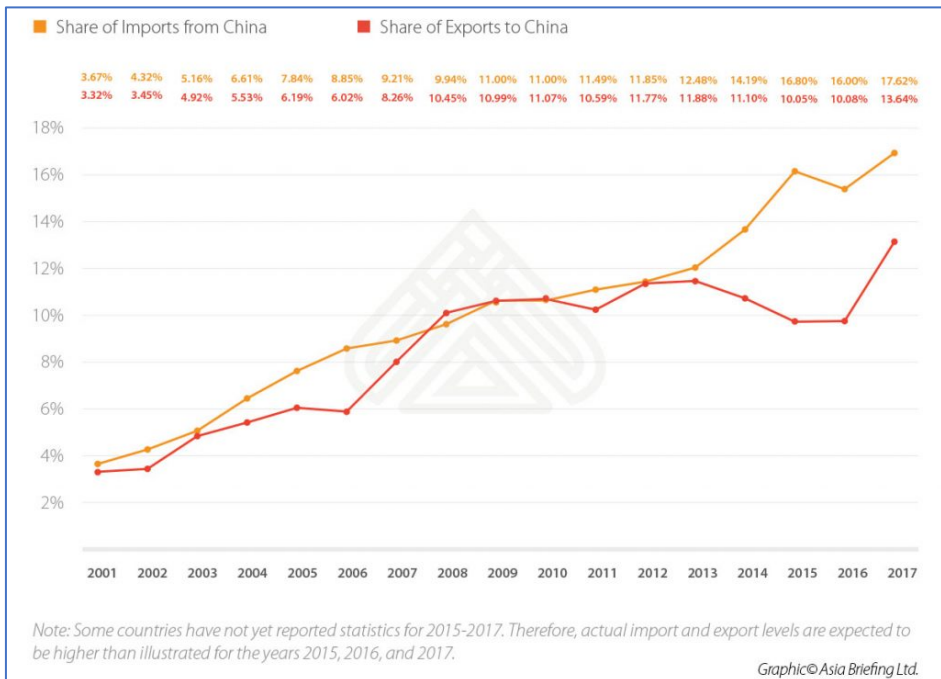
Figure 1 : Africa-China Trade Relations in 2001–2017.

China is still a developing country, according to the discourse of the World Trade Organization in 2019. This allows China to enjoy "special and differential treatment", to have the chance to ensure subsidies in agriculture, crating better conditions for market-entry than developed countries. China wants to seize the opportunities enjoyed by developing countries, and to label itself as "the world's largest developing country" while rejecting the developed status (Lee 2019). China is focusing on south-south cooperation policies and is seeking to collaborate with other developing countries at both bilateral and multilateral levels. The bilateral relations between African states and China have increased gradually over the years, and the economic aspect can be considered to be the core of these relations.