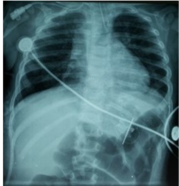
Figure 4: Postoperative day 4, atelectasis of the right lung recovered and then the patient was ex-tubated