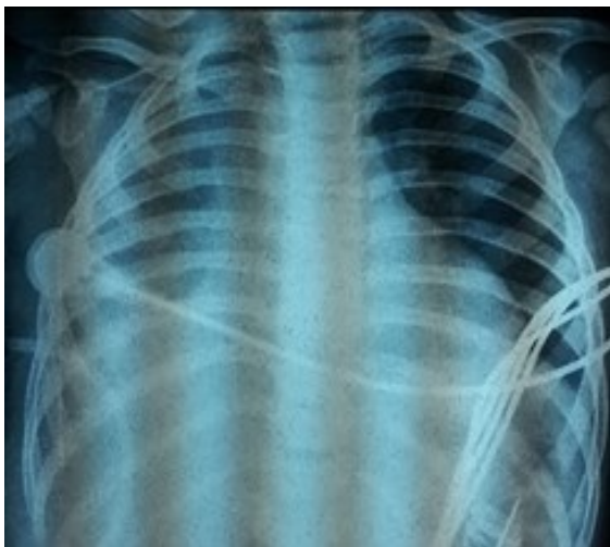
Figure 3: Postoperative day 3, partial collapse of the right lung (recurrent atelectasis) the patient was re-entubated. Pulmozyme treatment was started.