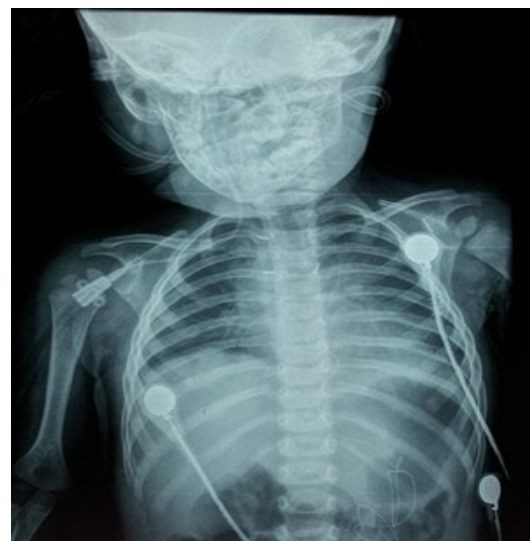
Figure 6 - Postoperative day 6