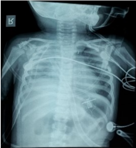
Figure 1: Postoperative day 1, chest x-ray with total atelectasis of the right lung. The patient was intubated