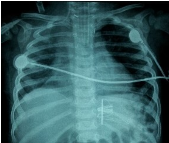
Figure 2: Postoperative day 2, atelectasis of the right lung recovered and then the patient was ex-tubated.