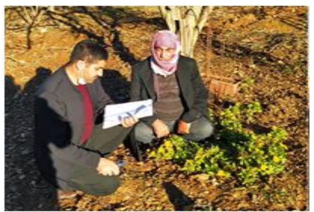
Figure 2. Interviews with local people (Suruç)

Mean age of the people who provided us information was 49. Examining the educational background of 44 people who provided us information, 10 were found out (23%) to have received no education at all, 19 (43%) were found out to be primary school graduates, 2 (4%) were secondary school graduates, 3 (7%) were high school graduates and 10 (23%) were university graduates. Elder people have been observed to be more experienced and acquainted about plants.