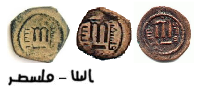
Figure 1: Arab-Byzantine coins minted in Aelia, 660-680 CE

In addition to the textual accounts, there are artefacts surviving from this early period that confirm the usage of the name Aelia by the Arab/ Muslim rulers. Numismatic evidence is particularly useful in this regard. One coin survives from the time of Mu'awiyah which contains a record of the official name used during his reign (40-60AH/661-680) in Arabic. A coin with the name Aelia was minted in Palestine at this time, which has both the names Iliyā' (Aelia) and Filisṭīn (Palestine) minted on it.