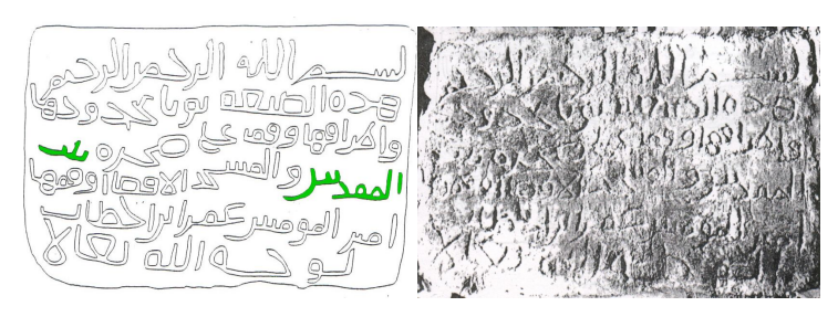
Figure 5: Stone engraving in Nuba, Hebron.

The first epigraphical evidence for the name Bayt al-Maqdis is the endowment in al-'Umarī Mosque in the village of Nuba north-west of Hebron. It is claimed that it dates back to before the end of the reign of the fourth Caliph 40 AH (Abū Sara 1993: 3-7). On the stone the following is engraved: