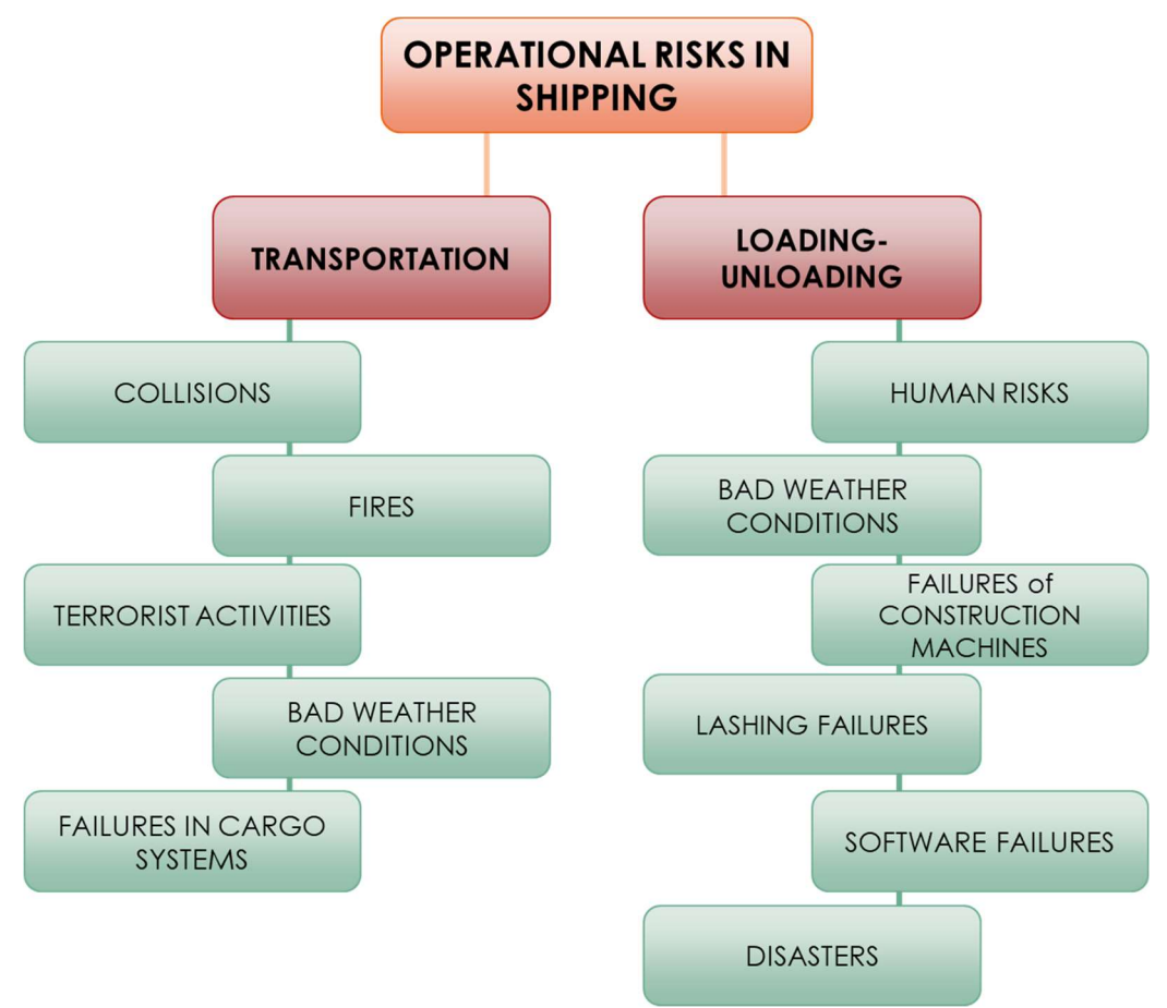
Fig. 2. Operational Risks in Shipping

As seen in the Figure 2, operational Risks in shipping can be subdivided into two heading which are "Risks encountered during transportation at sea" and "Risks encountered during loading-unloading operations in ports". The operational risks encountered during transportation at sea are collisions, fires, terrorist activities, bad weather conditions and failures in cargo systems. The operational risks encountered during loading-unloading operations in ports are human risks, bad weather conditions, failures of construction machines, lashing failures and software failures.