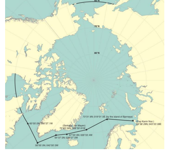
Fig. 1. Arctic Region in Polar Code (IMO, 2007).

In the scope of IMO Polar Code, the Arctic region is defined as waters which are located north of 60°N parallel for America and Asia shores and north of the line passing through the south of Greenland at 58°N parallel, north of Iceland, Island Jan Mayen, Island Bjornoya and Kanin Nos for the northern side of the Atlantic and Europe as shown in Figure 1 (IMO, 2017). Inland waters, territorial seas, and exclusive economic zones in the region are governed by eight countries: Canada, Denmark, Finland, Iceland, Norway, Russia, Sweden, and United States according to their geographic locations (URL 3, 2021).