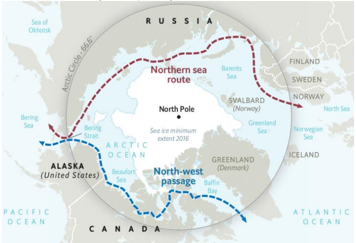
Fig. 2. Major Passage Routes in Arctic Region (URL 1., 2009).

One of the various consequences of global climate change affecting the whole world is the alternative routes emerging in the Arctic Region (Lasserre, 2015; Bayırhan and Gazioğlu, 2021). Currently, there are two major passages located in the region. Northwest Passage is the route connecting the Pacific and Atlantic starting from Bering Strait and along the northern coasts of Alaska and Canada. It divides into various routes in Canadian Archipelago, converges again in the Baffin Bay between