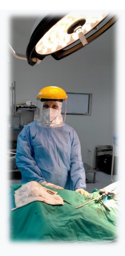
Figure 2. Scrub nurse with PPE during a lumbar fracture operation

The OR was stocked with all possible medications, fluids and other equipment that may be necessary intraoperatively to minimize room traffic. Prone position was the most commonly employed approach but when anterior approach was necessary, the patient's nostrils and mouth was covered by a cotton sponge after intubation.