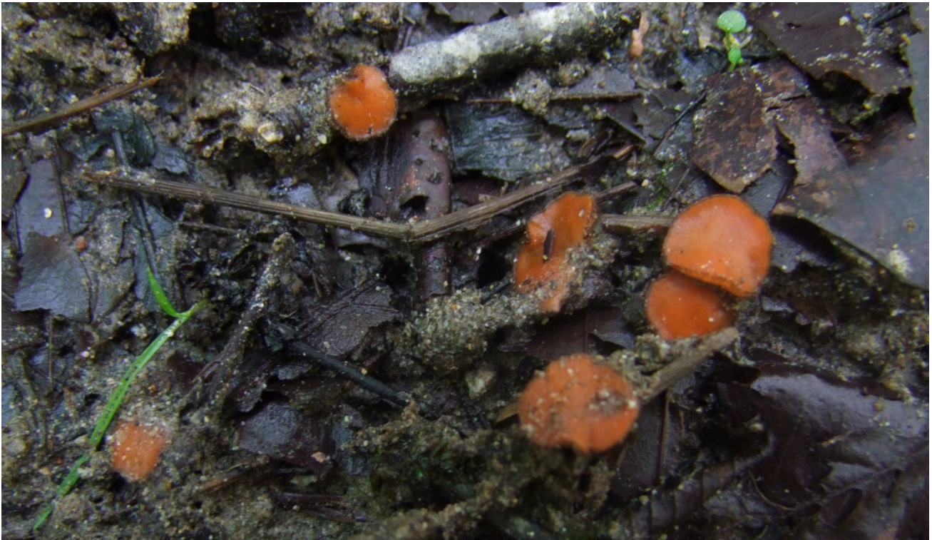
Figure 1. Ascocarps of Scutellinia kerguelensis

Scutellinia kerguelensis was reported to grow on damp soil and wet wood singly or gregariously (Breitenbach and Kränzlin, 1984; Medardi, 2006; Thompson, 2013).