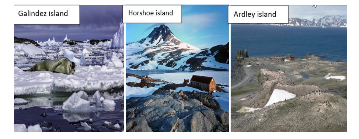
Figure 2. Islands visited by Turkish scientists to conduct studies