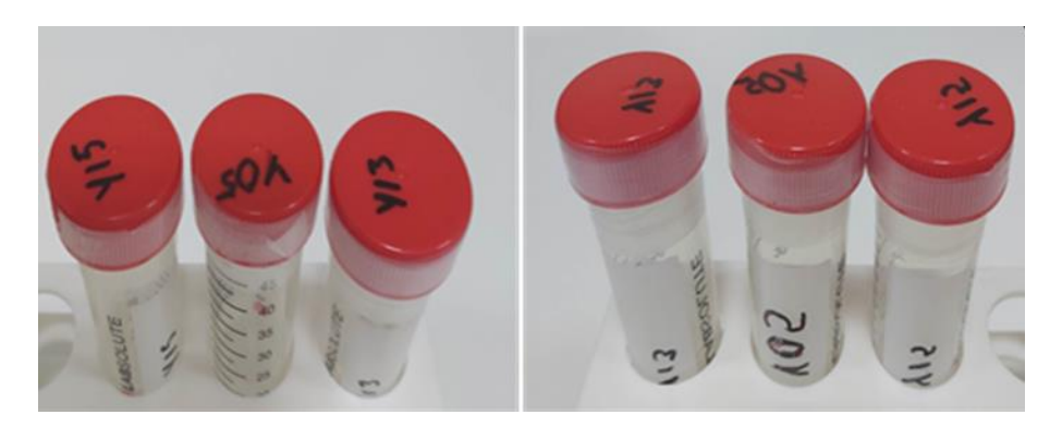
Figure 1. Samples collected from 3 different regions from the Antarctic Peninsula (original)

In the study, lake sediment, seawater, and green algae ice samples were collected from 3 different stations (Figure 1). Galindez Island, Horshoe Island, and Ardley Island were some of the regions visited by our Turkish scientists to conduct scientific studies within the scope of the National Polar Science Program (2018-2022) carried out under the auspices of the Presidency, under the responsibility of the Ministry of Industry and Technology and the coordination of TÜBİTAK Marmara Research Center (MAM) Polar Research Institute (KARE) (Figure 2).