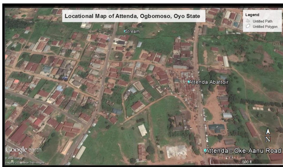
Figure 1. Locational Map of Attenda Abattoir, Ogbomoso, Oyo State

To assess the characteristics of the waste, 5kg of daily disposed semisolid waste in the abattoir were collected, sorted and each constituent was weighed. To assess the impact of the abattoir, water samples were obtained from Point of Discharge (POD) of wastewater to the stream, 30 meters, 60 meters and 90 meters on the course of the stream. Also, samples were obtained from each well found within 30 meters, 60 meters, and 90 meters from the abattoir. Collection of samples at intervals to determine the distance decay, if any, of the abattoir. The obtained water samples were tested for pH, Conductivity, Lead, Dissolved Oxygen, Cadmium, and bacterial content - Salmonella sp. and E. coli, using the procedure of [7]. Obtained data were subjected to descriptive statistics such as frequency count and percentage. Tables were also used to summarise data.