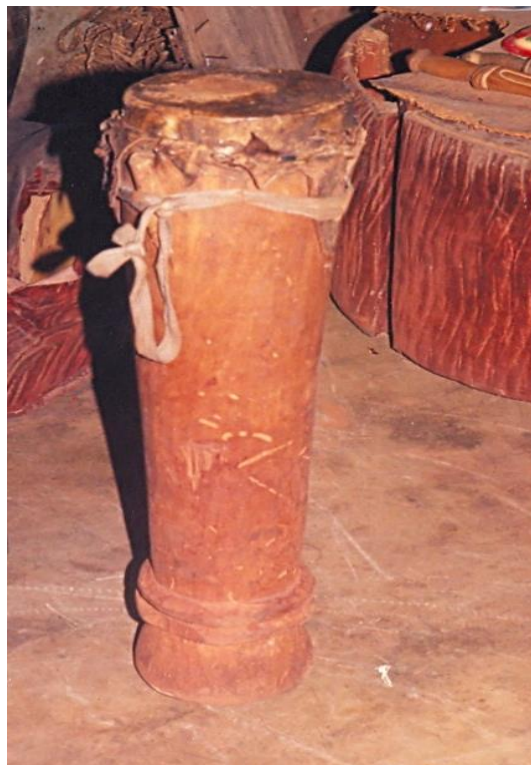
Figure 1. Okwulaga drum standing on its open end

Only membranophone and idiophone instruments are associated with Odumu music performance. These are three single-membrane drums (one okwulaga and two uba ), a slit drum, and a metal gong. The okwulaga is an outstanding drum employed in Odumu dance music. It has a comparatively long wooden barrel of about 32 inches in length, but possesses a smaller membrane diameter of about 26 inches.