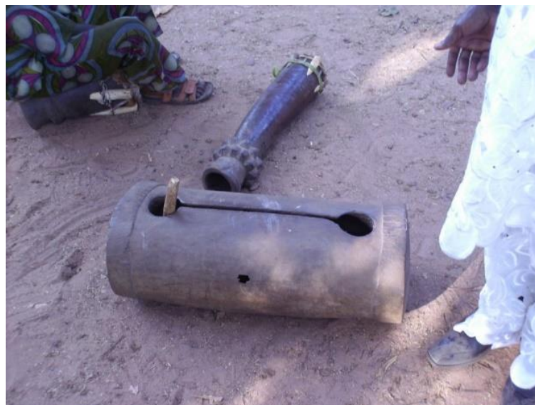
Figure 4. An Agidigbe (slit drum) and an okwulaga lying beside.

The other major idiophone instrument is the slit drum, known as agidigbe in Idoma. According to Vidal (2012: 47), it is made from a dried tree trunk, with its inner content dug out and designed to have two openings known as the lips which produce two distinct tones (Figure 4). Although musical groups like Odumu make use of agidigbe in their performances, it is the most prominent instrument of the Ibo dance group. Apart from musical use, it is also used for sending coded messages within and between communities.