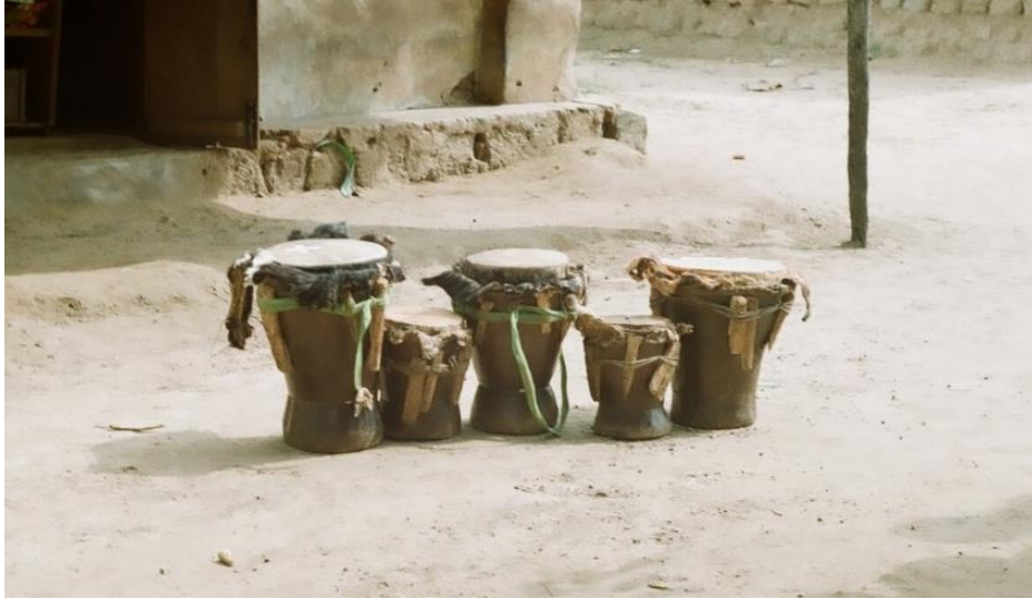
Figure 2. A set of five uba (single-headed membrane drums

The high-pitched drums which are particularly used to direct dance steps in the absence of okwulaga are referred to as ob'uba (male drum) while the low-pitched ones, are called en'uba (mother drum). The mother drums are usually larger in size than the male drums. In instances where the master drummer performs on two uba drums simultaneously, he combines the mother drum with the male drum. The other drums play unvaried rhythmic patterns, which provide textural support and strength for the master drum.