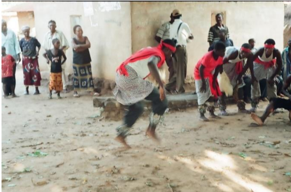
Figure 6. An Odumu dancer engaged in a solo dance while others watch

opposite the instrumentalists and begin dancing simultaneously, following which they change into a single line formation beside the instrumentalists, allowing individual dancers to enter the stage to perform one after