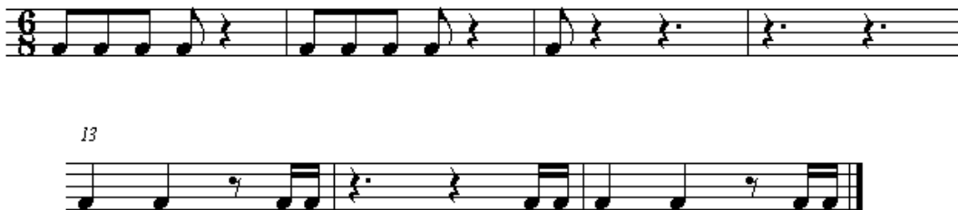
Score 1: A brief okwulaga rhythmic excerpt played in consort of other instruments to accompany odumu dance.

Although okwulaga is the most prominent instrument in an Odumu ensemble which produces a domineering sound above the other drums, it is low-pitched. It is played by a drummer who sits on the wooden frame and strikes the drum membrane with his two palms. As master instrument, it produces different rhythmic patterns to dialogue with and communicate instructions from the master instrumentalist to other instruments and dancers, thereby directing the performance. Therefore, the Okwulaga observes moments of rest at intervals usually to allow a dancer take his position on stage. Once the dancer is on stage, the master instrument begins its series of rhythmic patterns to guide the dancer. At moments of rest, the master instrument plays single notes that occur on the first beat of the bar. The following are examples of Okwulaga basic rhythmic themes which are varied and developed into different patterns.