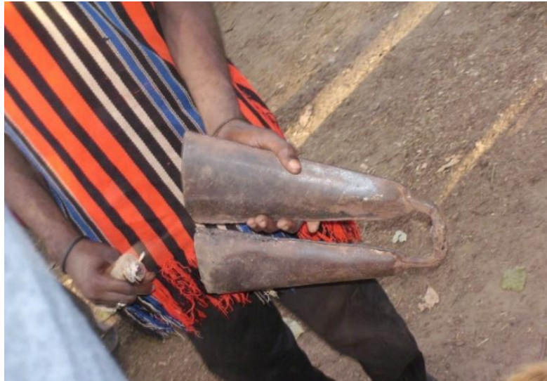
Figure 3. Oke (Hand-held double bell) (Personal archive, 2008)

The other major idiophone instrument is the slit drum, known as agidigbe in Idoma. According to Vidal (2012: 47), it is made from a dried tree trunk, with its inner content dug out and designed to have two openings known as the lips which produce two distinct tones (Figure 4). Although musical groups like Odumu make use of agidigbe in their performances, it is the most prominent instrument of the Ibo dance group. Apart from musical use, it is also used for sending coded messages within and between communities.