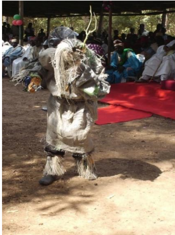
Figure 5. Ukpoku masked dancer

Odumu performances are structured in three sections: Inspection or pre-performance , performance , and closing stage . The inspection or pre-performance stage begins when the instrumentalists start the music for the dance. This ushers in the Ukpokwu who runs into the open stage with a shout and a whip in his hand to enforce crowd control. He charges from one end of the stage to the other, forcing spectators to create enough space for the performance. This done, the Ukpokwu exits the stage while the lead dancer runs into the stage and performs a solo dance, to enable him inspect the performance arena/stage and the preparedness of the instrumentalists. He dances alone for some seconds, usually facing the instrumentalists, and then runs off the stage. This marks the end of the inspection or pre-performance stage . While the instrumentalists continue their music, a short interval is allowed before the second section begins.