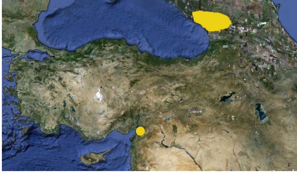
Figure 7. Distribution of the Caucasian species of Otiorynchus ( Sulcorhynchus ) (yellow area), and of Otiorynchus ( Sulcorhynchus ) emrei Avgın & Colonnelli n. sp. (yellow dot). Satellite map from Googleearth.