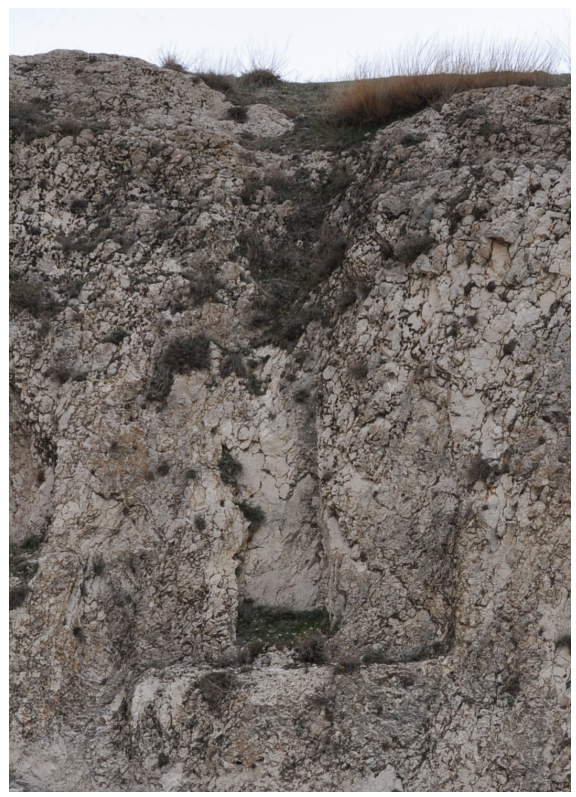
Fig. 3: Sacred niche which carved into the rock.

The city was captured by the Seljuk Sultan Tuğrul Bey in 1054-10558. After the Battle of Manzikert in 1071, first, the Marwanoğulları then Ahlatsahlar took over the region9. As from this period, it often changed hands among many civilizations. In 1203-1204 Ayyubids<sup>10</sup>, the following years Georgians and Harzemshahs dominated the region<sup>11</sup>. In the vacuum of authority formed by the Mongol threat, Alaaddin Keykubad annexed the region to the Seljuk territory in 1232-1233<sup>12</sup>. In this period, publics works started in the region