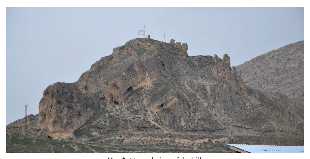
Fig. 2: General view of the hill.