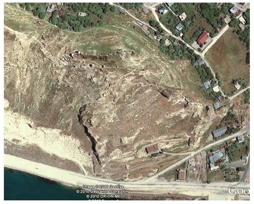
Fig. 1: Adilcevaz Castle.