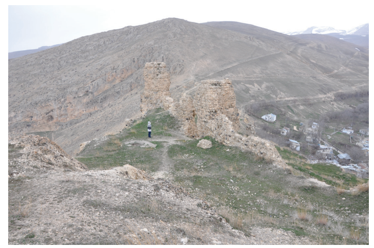
Fig. 4: Citadel; view from interior. (Phase I)