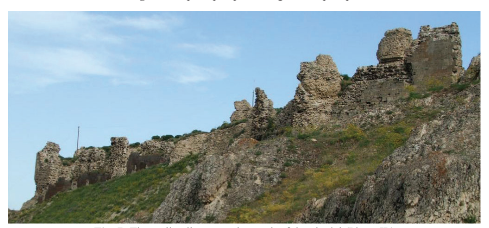
Fig. 7: The wall, adjacent to the north of the citadel (Phase II )