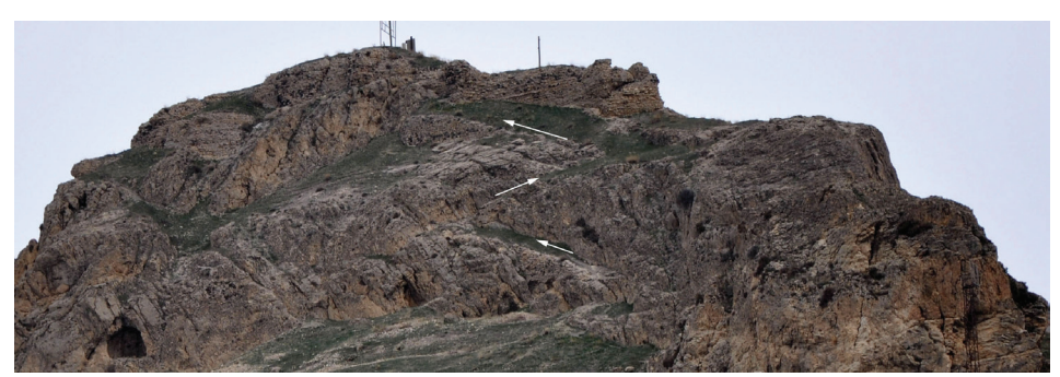
Fig. 6: Ramp-shaped path along the steep slope.