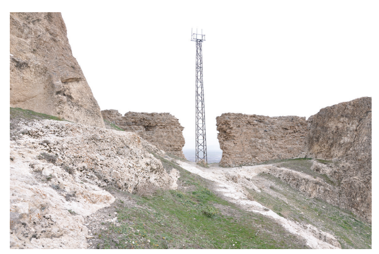
Fig. 12: The gate is placed in the space between two large andesite rocks.