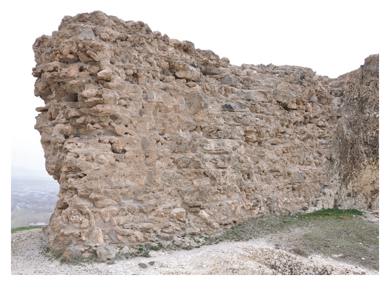
Fig. 13: Traces of stairs inside the wall.

andesite rocks. It is understood that originally, gate was reinforced with a double tower. The towers are square in plan. The tower on the left is partially in good condition. Although the tower on the right has collapsed, its foundation can be followed clearly on the rock it rises on. No trace of the shape of the door has survived. However, from the traces on the upper parts of the rock, the original height of the gate could have been around 9 m. As for Inside the wall, traces of stairs that leading up to the parados (protected walkway) can be seen (Fig. 12, 13). Although the façade stones disappear, the traces show that the walls were originally covered with cut stone.