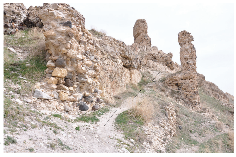
Fig. 8: Gate in the Southwest.