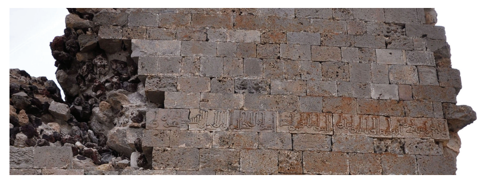
Fig. 9: Islamic inscription.

The second gate, which opened from the courtyard into the fortification, is completely demolished. However, the limits of the entrance are still clear. The heavy destruction in this part of the fortress indicates that the attacks took place in this direction. Probably the road leading to the gate should have allowed the war machines to get close to the front of the gate.