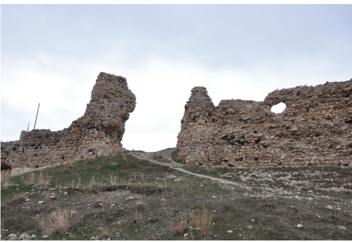
Fig. 5 : The northern gate.

that reinforce the fortification walls are placed at more frequent intervals in the north direction. Massive tower buttresses sitting on the bedrock were placed in three corners. These buttresses are for static purposes. The entrance to the citadel is provided by two gates opened in the north and south.