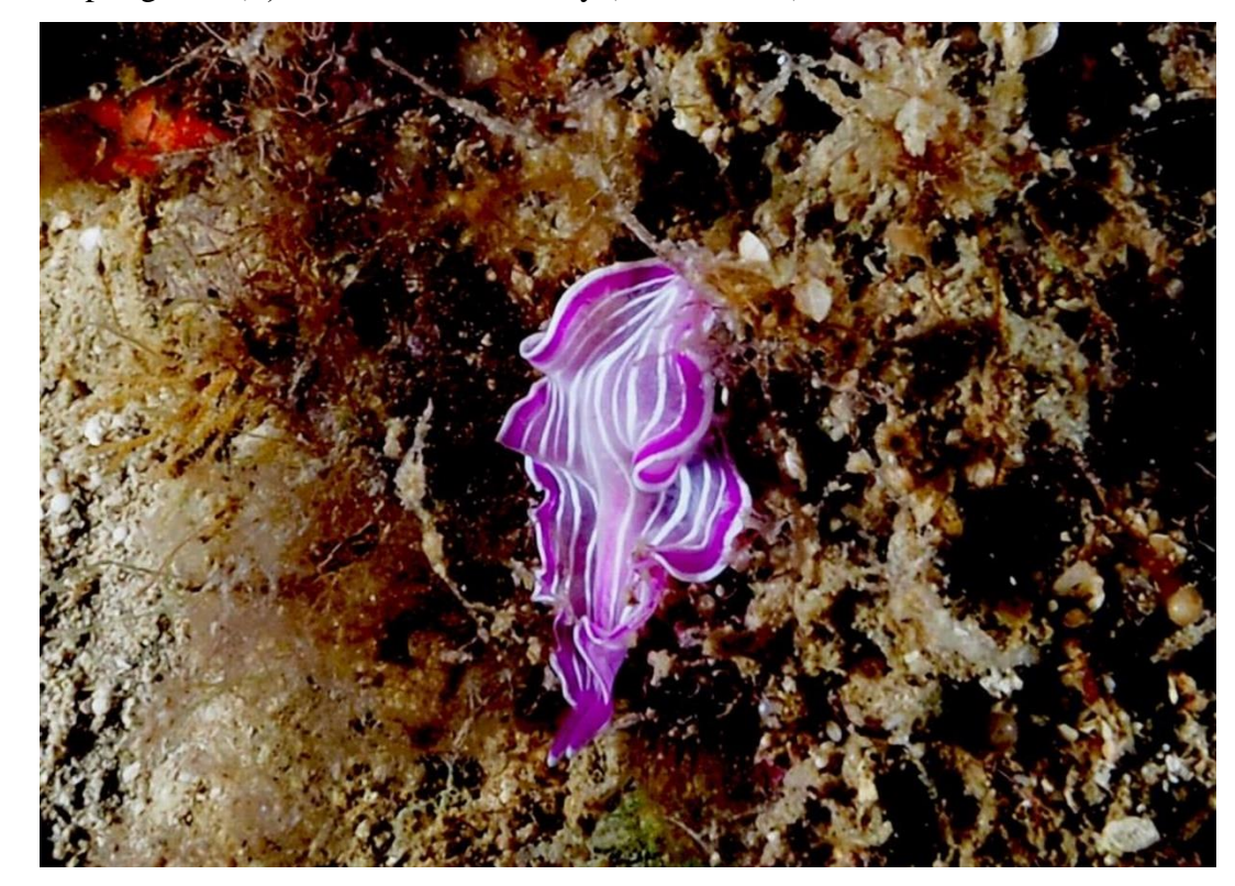
Figure 2. Prostheceraeus roseus from Cevlik coast (Eastern Mediterranean, Turkey)