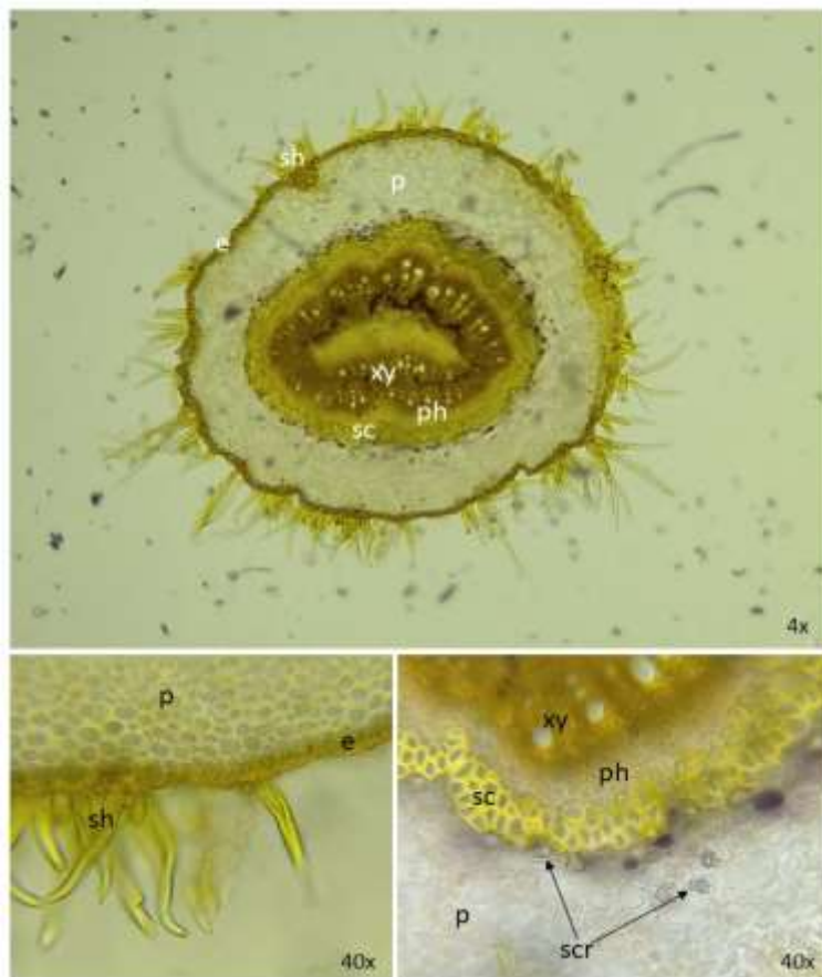
Figure 3. The transverse section of petiole (e: epidermis, p: parenchyma, ph: phloem, sc: sclerenchyma, scr: solitary crystal, sh: stellate hair, xy: xylem)