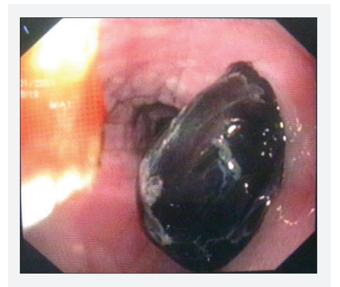
Fig. 2. Clot in the aortoesophageal fistula region owerflowing into the esophagus lumen.

There were two options to close the aortoesophageal fistula: Surgery and endovascular stent placement. Because of high mortality risk the surgery was not performed. Endovascular stent placement was also not applicable because diameter of the available stent was smaller than the stent already placed. Following a sudden nausea vomiting a massive bleeding began. The patient was developed respiratory and cardiac arrest. He was intubated. An attempt to adjust his hemodynamics was made but the patient could not be recovered and died on the third day of his arrival.