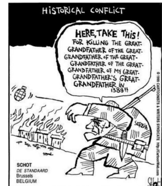
Figure 3: Cartoon Drawn by Schot in 1999 to Depict the Historical Background of the Genocide in Bosnia and Herzegovina