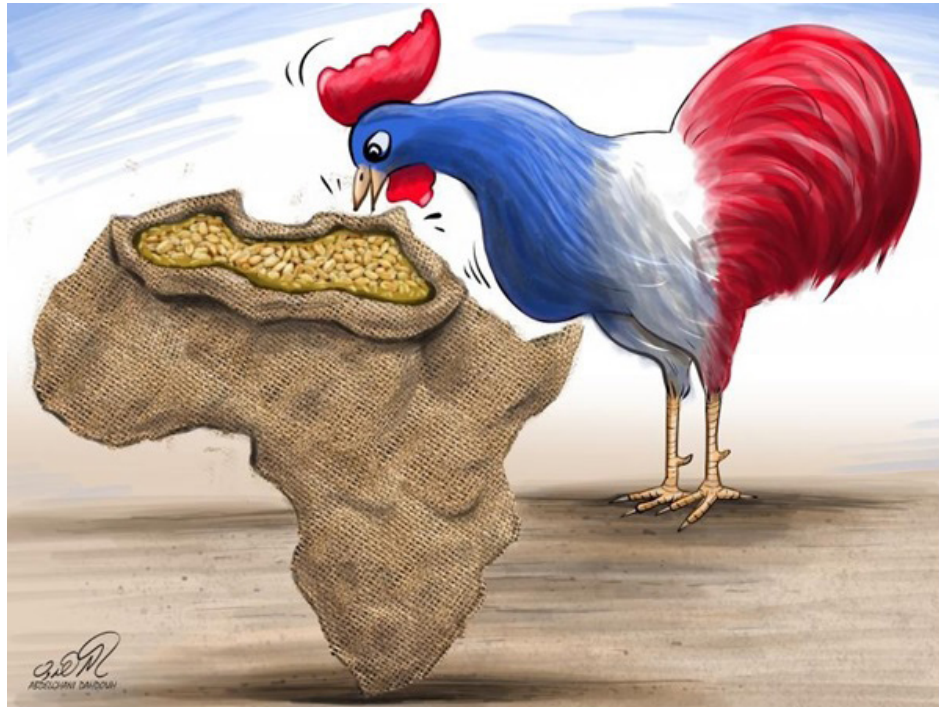
Figure 5: France's Exploitation of African Countries

could get support from its leaders, the Armenians began to attempt to annex the Karabakh region. After the disintegration of the USSR, Azerbaijan became an independent state and abolished the autonomous status of Karabakh on November 26, 1991, putting the region under the control of its national government. This decision led the Karabakh Armenians to declare independence on December 10, 1991. After the military forces of the Russian Federation, the successor of the USSR, withdrew from Nagorno-Karabakh in 1992, Armenia's activities in Nagorno-Karabakh led to a war with Azerbaijan. Finally, in 1993-1994, Armenia, supported by the Russian army, invaded the Azerbaijani lands between Karabakh and Armenia & Nagorno-Karabakh. This created a de facto situation with the lands from the Armenian border, including Karabakh, occupied by Armenia. The Armenians, supported by the Russian army during this occupation, refused to withdraw from Azerbaijan, especially Karabakh, despite all international agreements and pressure.