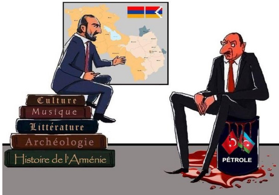
Figure 6: Cartoon Titled “I Know It Hurts, but This Is the Truth”

This cartoon reflects the intellectual background of the Armenian diaspora (Figure 6). Pashinyan is drawn sitting on a platform and Azerbaijan's President Ilham Aliyev is seated on an oil barrel, which implies that the message intended to be conveyed by the cartoon has nothing to do with historical facts, and that its real intention is to manipulate perceptions. Pashinyan's platform represents Armenian history, archeology, literature, music and culture, while Aliyev's oil barrel the flags of Azerbaijan and the Republic of Turkey sits a pool of blood. The cartoon illustrates how the Armenian diaspora envisages the two nations. It is noteworthy that this cartoon reflects how they see Turks who have lived in Central Asia, the Caucasus and Anatolia for hundreds of years, while attempting to represent the Armenians, who have never been able to found a strong state anywhere in history, as the representatives of a historic Great Armenia.