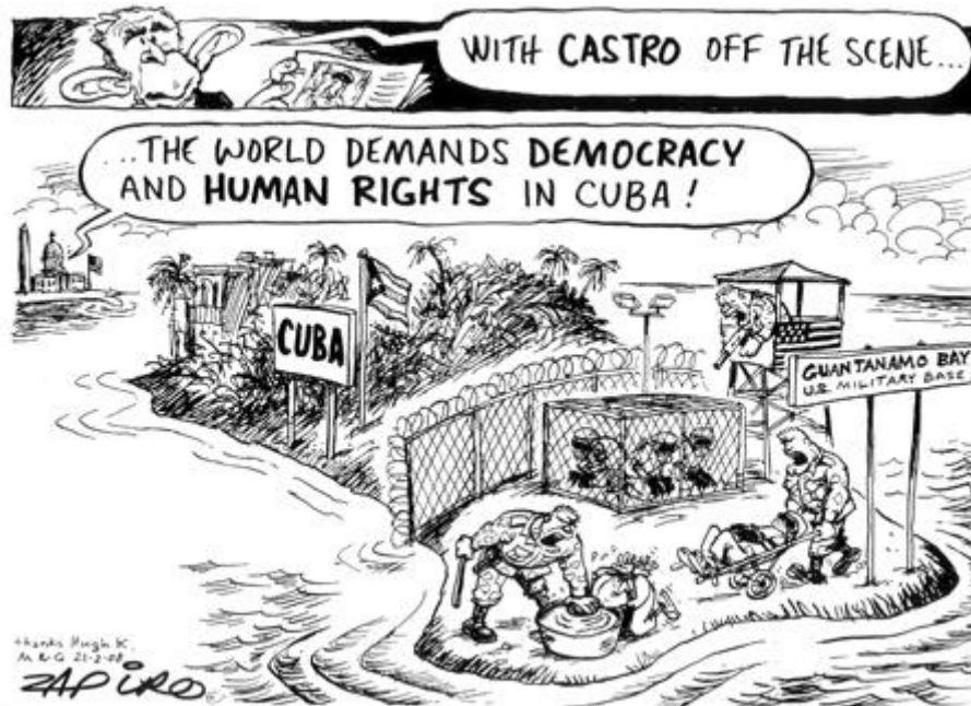
Figure 4: The World Demands Democracy and Human Rights in Cuba

The United States has a decisive role in world politics. Especially since the end of the cold war, the US has been perceived as the representative, champion and enforcer of basic human rights throughout the world (Bajpai, 2007: 32). This study's fourth cartoon associates its practices in Guantanamo, US territory in the Guantanamo Bay in eastern Cuba, which is used as a prison for criminals. In the cartoon, "Castro is off the scene", a voice rising from the Americas says "The world demands democracy and human rights in Cuba." The US claims that there are problems with basic human rights in Cuba, which the United States sees as a rogue state. The cartoon emphasizes the ironic contradiction of US discourse about Cuba by pointing that in Guantanamo, US territory in Cuba, prisoners are subjected to torture and inhumane treatment (Figure 4). The cartoon, signed Zapiro, was drawn by Jonathan Shapiro and published in the Mail & Guardian on February 21, 2008 with the title "The world demands democracy and human rights in Cuba" (Shapiro, 2008).