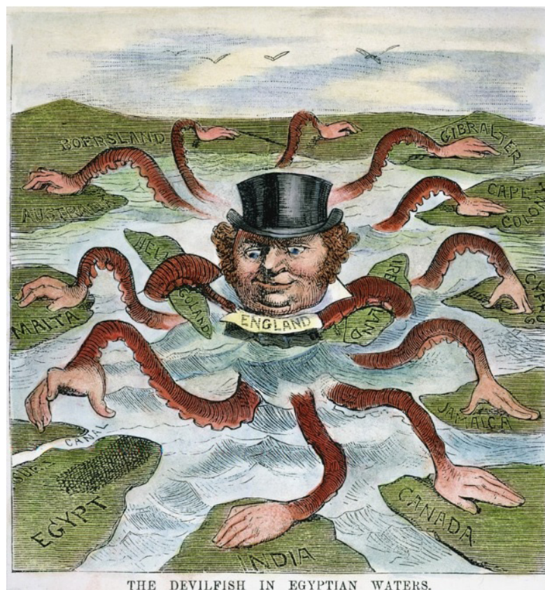
Figure 1: The Devilfish in Egyptian Waters

The first cartoon that was the subject of the research was the one drawn by John Bull in 1882 and titled "Octopus in Egyptian Waters". In the cartoon, England is depicted as an octopus taking over lands in different continents. In the cartoon, " The Devilfish in Egyptian Waters ," drawn by John Bull in 1882, England is depicted as an octopus taking over lands on different continents. When this cartoon was drawn, England had completed the skeleton of "the empire on which the sun never sets." The arms of the English octopus stretch from Australia in the Pacific Ocean to Gibraltar, the entrance to the Mediterranean Sea, from the Atlantic Ocean to Malta in the Mediterranean, from India in the Indian Ocean to Jamaica in the Caribbean Sea, and from Jamaica to Canada in the northwest Atlantic Ocean. Just as an octopus control its many arms, England, an island state, also controlled territories in many parts of the world (Figure 1). It is understood that John Bull's cartoon symbolizes the administration of the regions dominated by the British Kingdom, which is defined as the "the empire on which the sun never sets." In fact, this satirical cartoon also exhibits a remarkable point depicting the island of England dominating the world as a metaphorical octopus, with colonies around the world in the grip of its tentacles.