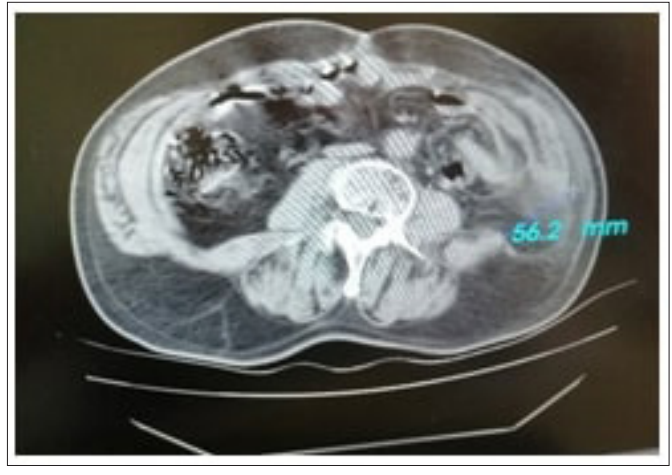
Figure 4 . Left lumbar petit hernia in CT

Five patients who were included in the study were operated and followed up by the same surgeon. Most patients consisted of women (n=4). The mean age was 58.2 years. As for the etiological reason of the disease, 3 patients were trauma-related and 2 patients were previous operations-related. The most common reason for hospital admission was left side pain and swelling. For diagnosis, all patients were asked to have computerized tomography (CT) ( Figure 4 ).