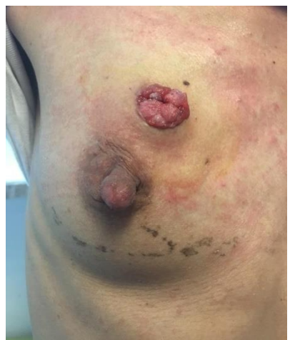
Figure 1. A non-eroded, vegetative, growing lesion was 4x4 cm in diameter and located on the inner-upper quadrant of the right breast

A 39-year-old female presented with a complaint of a non-eroded, vegetative, growing lesion located on the inner-upper quadrant of her right breast (Figure 1). She declared that It took 3-4 weeks since the emergence of the lesion. She had no history of chemical exposure or skin burn in the involved area, comorbidity, immunosuppression, smoking, alcohol consumption, drug use, or family history of cancer. She had been working as a shepherd for many years and she had never used sun protectors. A mass located on the breast skin which is approximately 4x4 cm in diameter was seen on physical examination, while no lymph node was palpated. There were no laboratory findings of infection.