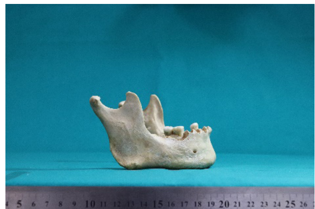
Figure 1: Lateral view from right side of mandible.

Angle of mandibular notch (AMN): Angle between the lines connecting the highest points of the coronoid process and head of mandible (point c-a, respectively) to the deepest point of the mandibular notch (b).