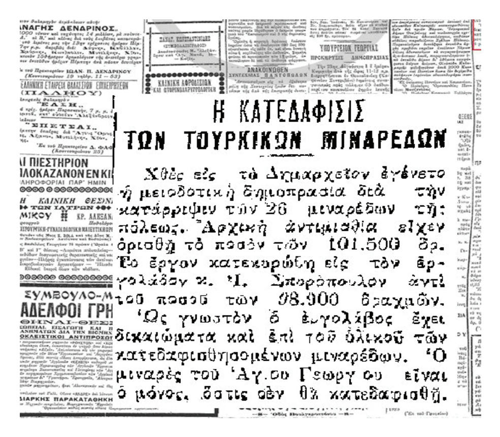
Picture 1: Newspaper "Macedonia" 13 August 1925, p.3

According to this announcement, mosques in the city will be demolished by an open reduction method and the city skyline will be cleared of minarets. The date in question is one year after the Turks left the city of Thessaloniki with the population exchange signed between Turkey and Greece which meant the uprooting and repatriating of around 1,5 million people. In this case, the savings of making use of the buildings are still valid, and the only unwanted image in the city is the minarets. The literal translation of the above advertisement is as follows: