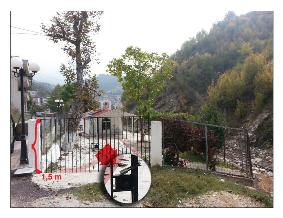
Picture 6: Example of a Semi-Arbited Padlocked Church, Isolated from Local Culture and Religion Groups (Greece)<sup>19</sup>

It is difficult to say that the church was built for worship. Inasmuch as, although the church is kept closed almost all days of the week, the padlock on its door, which is worn by a Christian religious official who rarely comes in, and the semi-fortified iron and wire door that a person cannot easily climb are proof of this. When the people of Mustafçova are asked why the church is isolated from the local people with such arbitration, they find it meaningless. However, the arbitration in question must have been made against a possible reaction letter likely to be written on the church.