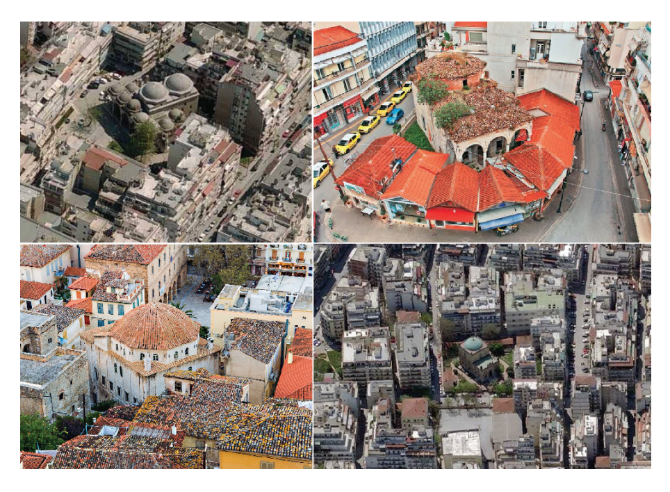
Picture 3: Zoning Plan Tactic in Which Mosques are Lost Among High Buildings, Clockwise Thessaloniki Ishak Pasa,6 Drama Mehmed Ağa,7 Anabolu Martyr Ali Pasa,<sup>8</sup> Thessaloniki Hamidiye Mosque<sup>9</sup>.

It should not be forgotten that in buildings to be deleted from the city skyline, the intent is to eliminate the long parts that enter the silhouette, and in Islamic structures, this is usually minarets. When the minaret of a building is destroyed or converted into a bell tower, the building can be used in any way. The standard brought by the Greek administrations in this regard also determines the size of a place of worship. As it is known, minarets are a part of Islamic temples and, beyond that, they are a symbol. The visibility of the minaret must be higher than the surrounding buildings for the prayer to be heard. However, seeing the minaret also means that the identity of the settlement is "less Greek". Because Orthodoxy is an important part of identity in Greece.