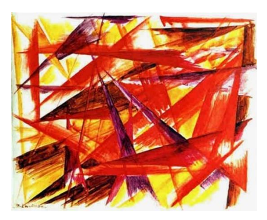
Figure 12 Red Rayonism, Mikhail Larionov, 1913. Watercolor on paper, The Merzinger collection, Switzerland

Similarly to Futurism in painting, the rays of Rayonism are in constant motion, and movement is a reoccurring theme in the paintings. It is either the chaos of rays resembling moving factory lights "Red Rayonism", Figure 12 or an expression of brim and sunlit cockerel spreading its fiery wings in agitated