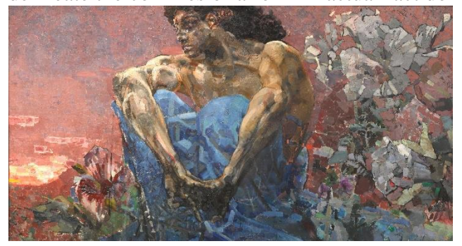
Figure 6 The Demon Seated, Mikhail Vrubel, 1890. Oil on canvas, Tretyakov Gallery, Moscow

the following statement by Vrubel would indicate: "The contours with which artists normally delineate the confines of a form in actual fact do not exist - they are merely an optical illusion