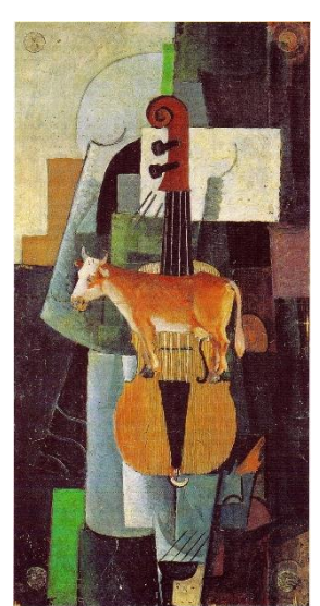
Figure 1 Kazimir Malevich, Cow and Fiddle, 1913. Wood, oil, The State Russian Museum, Saint-Petersburg