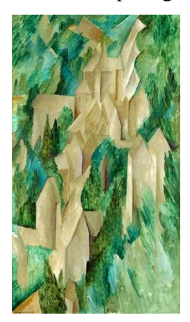
Figure 9 La Roche-Guyon, The Castle, Georges Braque, 1909. Oil on canvas, Moderna Museet,

Comparing "Castle at la Roche-Guyon" Figure 9, and the "Cats (rayist percep.[tion] in