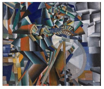
Figure 5 The Knifegrinder or Principle of Glittering, Kazimir Malevich, 1912-13. Oil on canvas, Yale University Art Gallery, New Haven