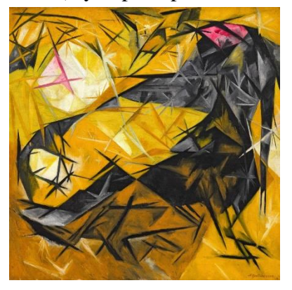
Figure 10 Cats (rayist percep.[tion] in rose, black, and yellow), Natalia Goncharova, 1913. Oil on canvas, Solomon R. Guggenheim Museum, New York

rose, black, and yellow)", Figure 10, one can clearly see a shift towards more abstract vision. While cubist example offers a recompilation of a very wellrecognizable type of an object – a castle surrounded by the green of the forest; Rayonism provides a picture of decompiled objects (cats) conveying the impression of the depicted animals through the non-uniformly directed color lines and angles. There is a certain