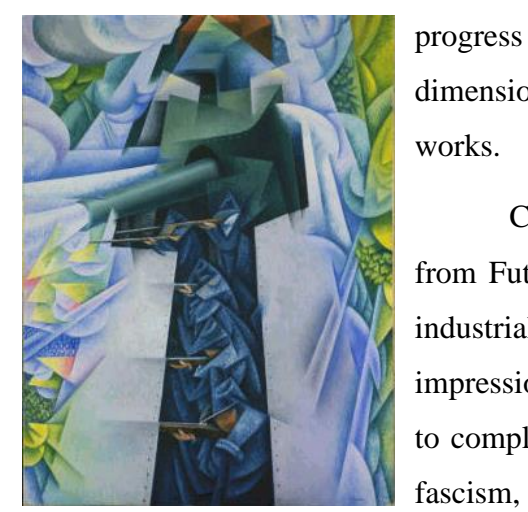
Figure 14 Armored Train in Action, Gino Severini, 1915. Oil on canvas, The Museum of Modern Art, New York

dimension with its own time and space is evident in rayonist works.