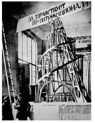
Figure 16 Monument to the Third International, Vladimir Tatlin, 1920. Saint-Petersburg

and would furthermore charge them with new political ideology and propaganda. While De Stjil architect Gerrit Rietveld, whose vision was that of lines and colors rather than rays, took the idea of