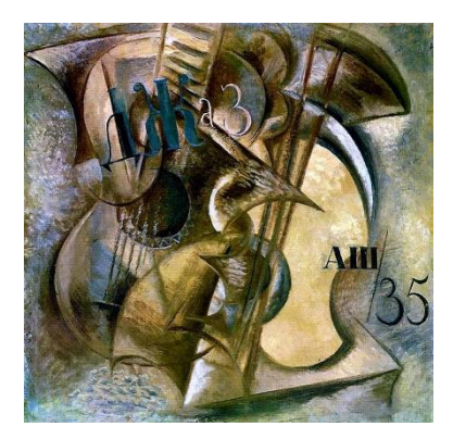
Figure 15 Jazz, Alexander Vasilyevich Shevchenko, 1935. Oil on cardboard, Russian Museum, Saint-Petersburg

Despite the positive progressive impression that one might get from the brief comparison, Rayonism did not last long. Reasons are quite diverse with one of the key ones being Larionov getting wounded in the war and being then unable to continue painting (or losing interest). His and Goncharova's leaving for Paris in 1915, never to return to Russia (a country, which also disappeared around that time). Their change of interests from painting to theater costumes and decorations design. This essentially left the painting movement without its ideological leaders and rooted it out of the context in which it was born instead of having it evolve.