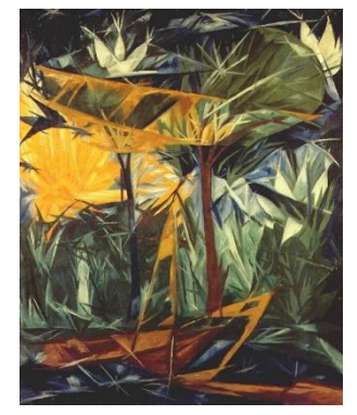
Figure 2 Yellow and Green Forest, Natalia Goncharova, 1913. Oil on canvas. Staatsgalerie

almost purely abstract and innovative in a wide range of aspects: concepts of objects, colors, composition, movement, space (dimensionality).