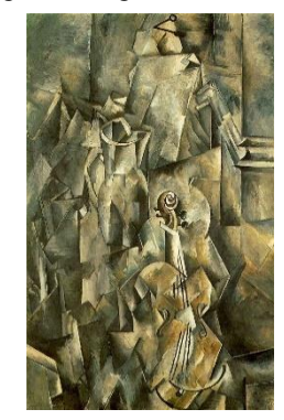
Figure 3 Violin and pitcher, Georges Braque, 1910. Kunstmuseum Basel, Basel