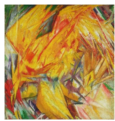
Figure 13 The Cockerel: A Rayonist Study, Mikhail Larionov, 1912. The State Tretyakov Gallery, Moscow

(paradoxically though, this blurred second head is counter to how it should have been in case of the right to left movement, illustrating the new dimension concept) Figure 13. Comparing to the "Armored train" by Severini, Figure 14, which is largely cubist in approach to objects (but not in style of depiction), a