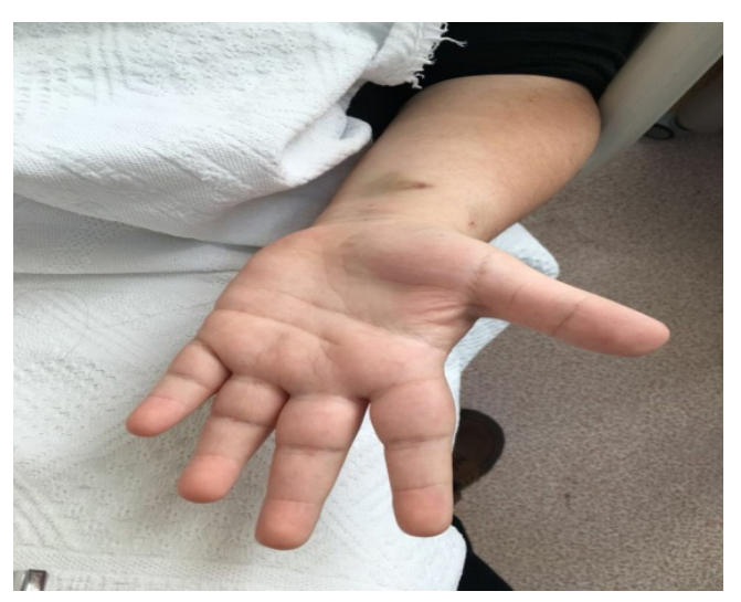
Fig. 3. Short fingers, joint laxity

The patient's appearance was obese and her weight recorded as 90 kilograms. She had no scoliosis. The patient's hemithorax both took part in breathing and lung sounds were bilaterally normal on auscultation. In the cardiac examination, no additional sound or murmur was recorded. Neck movements were natural, mallampati score were 2 and mouth opening were normal. The patient had joint laxity and it was confirmed that her fingers were shorter then normal (Fig. 3).