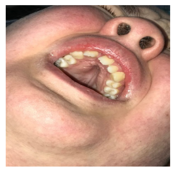
Fig. 2. High palate

Her tooth gaps were wide, her nasal septum was low and her ears was low-set (Fig. 2).