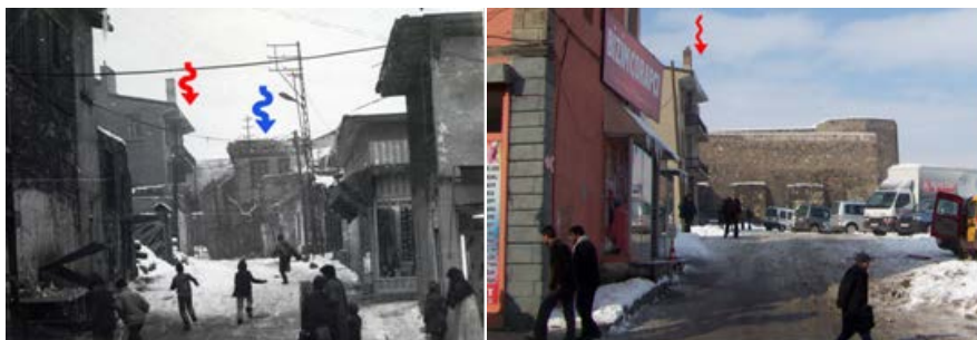
a) (Anonymous, 2006), (Fractal value: 1,445)