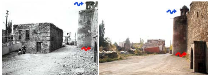
a) (Anonymous, 2006), (Fractal value: 1,876) b) (Original, 2007), (Fractal value: 1,745) Figure 11. Physical alterations on the southern walls of the city castle and its location