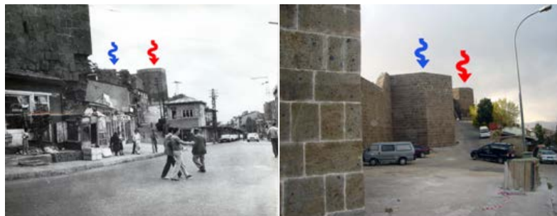
a) (Anonymous, 2006), (Fractal value: 1,717)