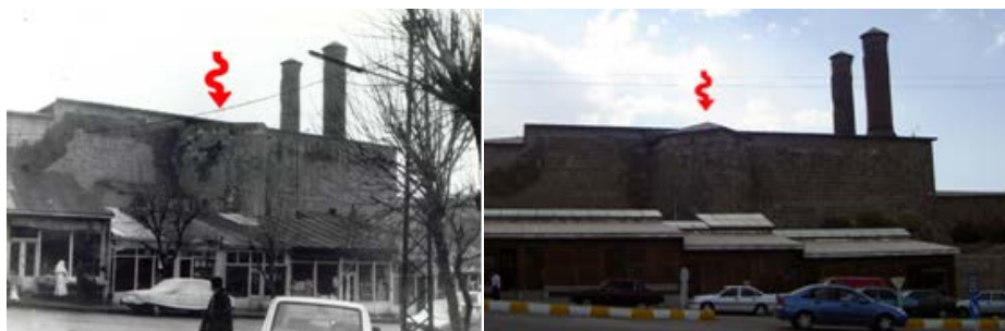
a) (Anonymous, 2006), (Fractal value: 1,34)