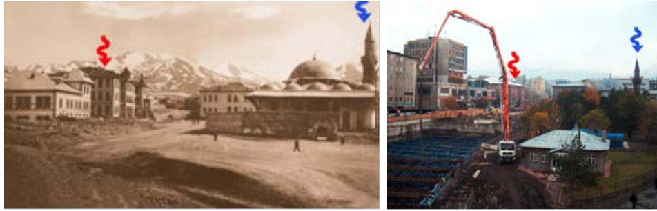
a) (Anonymous, 2012c), (Fractal value: 1,526) b) (Original, 2007), (Fractal value: 1,495) Figure 2. Physical alterations in the Old Governorship Office square