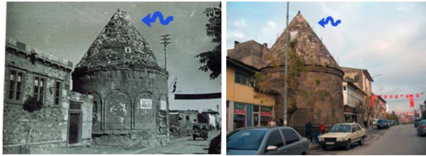
a) (Anonymous, 1936), (Fractal value; 1,826) b) (Original, 2007), (Fractal value; 1,527) Figure 3. Physical alterations in Cimcime Hatun Dome and its location