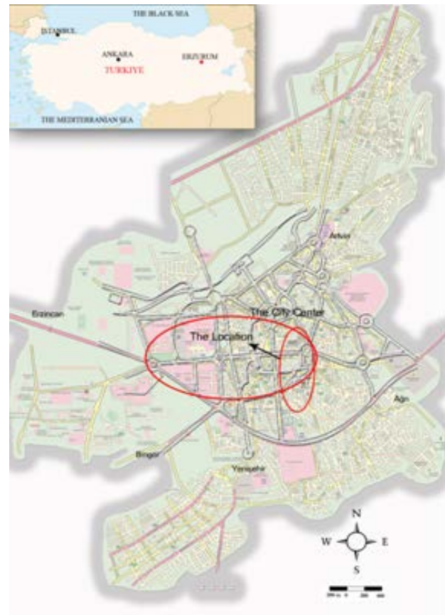
Figure 1. The location of study area

The material of the study consists of all historical monuments, samples of civilian architecture, social structures, squares, and streets within the boundaries of Erzurum Protected Urban Area. This area also forms the core of historical city and is a center defining the city and reflecting its identity and past.