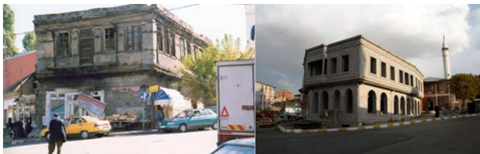
a) (Yeşil, 2003), (Fractal value: 1,694) b) (Original, 2007), (Fractal value: 1,478) Figure 12. Physical alterations in the Tebrizkapı Street and its location