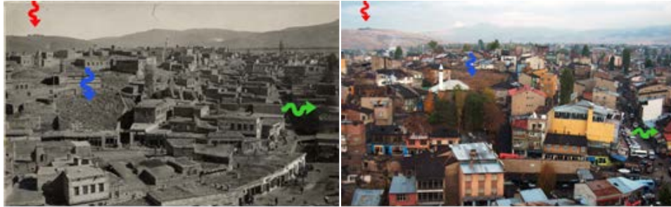
a) (Elginöz, 2007), (Fractal value: 1,890) b) (Original, 2007), (Fractal value: 1,923) Figure 5. Physical alterations in Cedit Neighborhood and its location