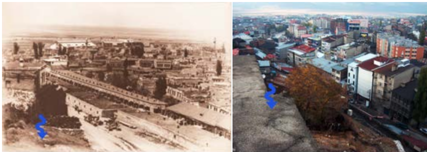
a) (Elginöz, 2007), (Fractal value: 1,87)