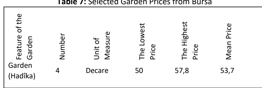
Table 7: Selected Garden Prices from Bursa

The table below includes data on three types of gardens with different features. At this point, it is important to know the unit of measures such as dönüm (decare), zira', evlek and kıt'a. According to Halil İnalcık 1 zira' = 0,537 sqm and 1 decare = 4 evleks = 919,302 sqm (İnalcık, 2017: 26, 44). And kit'a means a piece without a numerical amount.