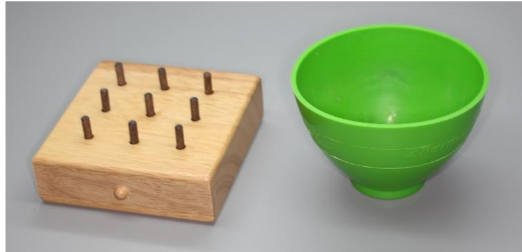
Figure1: 9-HPT test kit

taken to complete the test activity in seconds is recorded as the score. The test begins with the dominant hand. Two consecutive trials with the dominant hand are immediately followed by two consecutive trials with the non-dominant hand. The means of the scores are recorded as the dominant and the non-dominant hand scores.