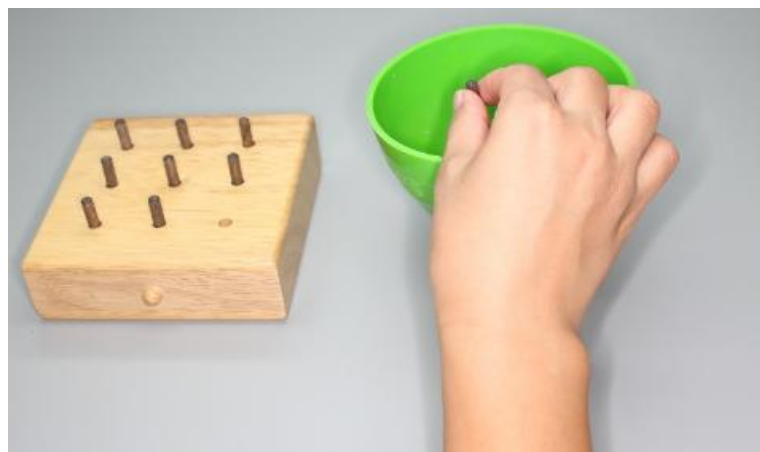
Figure 2: 9-HPT test