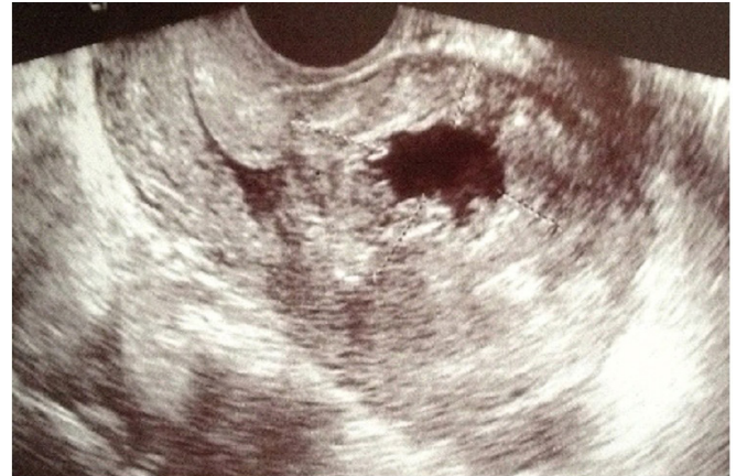
Figure 3. Transvaginal ultrasonography 1 week after curettage. Persistent ectopic gestational sac was still present in the lower part of the anterior uterine wall at the site of the cesarean section scar. Irregularity of the inner wall of the ectopic gestational sac was detected.

(including suction evacuation, and medical therapy) were offered to mother. She preferred to go for surgical intervention. In our patient, evacuation was performed 2 days after the diagnosis. There was no massive uterine bleeding after dilatation and curettage (D&C). \beta -hCG level was 6717 after D&C. 10 days after the evacuation, the \beta -hCG level was 3204 IU/L. USG and MRI coronal section images revealed persistant gestational sac measuring 5,7 * 4,8 cm and hematometra (Figure 3).