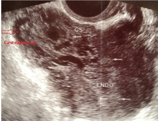
Figure 1. Endovaginal ultrasonography. Ectopic gestational sac was seen in the lower part of the anterior uterine wall at the site of the cesarean section scar with no fetal parts and yolk sac. Endometrial cavity is empty. Red arrow shows GS: gestational sac. Endo: Endometrium.

The cervical canal was closed. Transvaginal ultrasonography (USG) revealed an ectopic pregnancy with a 12*16*11 mm situated in the lower part of the anterior uterine wall at the site of the cesarean section scar with no fetal parts (Figure 1).