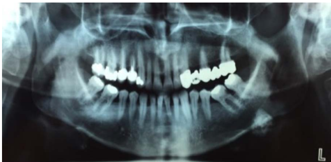
Figure 1. Panoramic radiograph of the patient.

49-year-old male patient with no systemic diseases administered to our clinic. Patient provided an ultrasonography report from another center specifying submandibular gland calculi. An orthopantomograph was obtained from the patient. During radiological examination a large radio opaque lesion was detected on the orthopantomograph just below the left mandibular border, in alignment with the second molar tooth (Figure-1). Computerized tomography (CT) examination