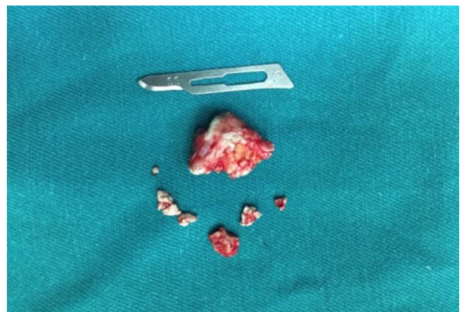
Figure 4. Macroscopic view of the sialolith.