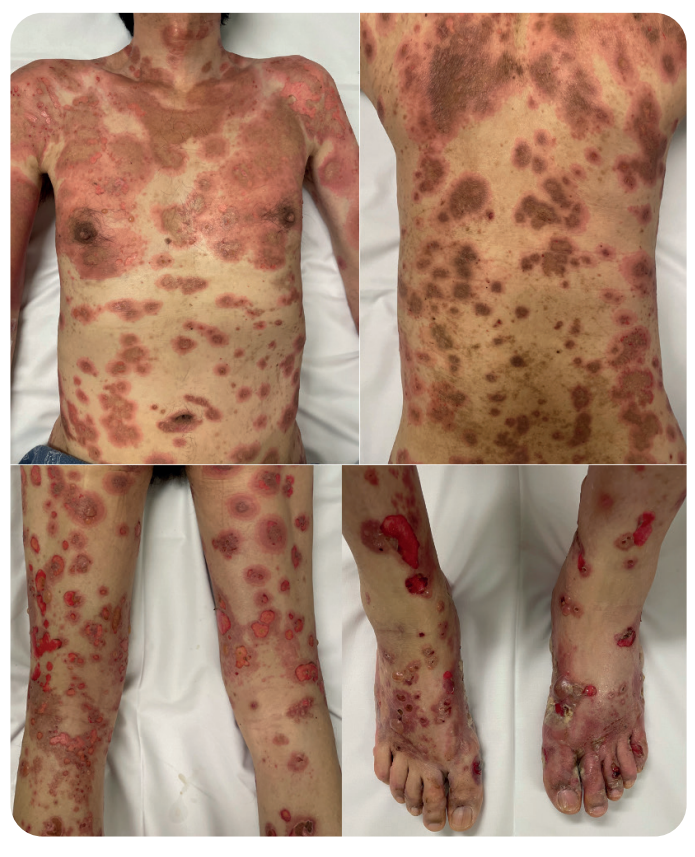
Fig. 1. Clinical photos of baseline with extensive blistering and erosions

At diagnosis, his Bullous Pemphigoid Disease Area Index (BPDAI)<sup>1</sup> confirmed severe bullous pemphigoid with an activity score of 91 and damage of 10. He had extensive blistering and erosions affecting his entire body. There was one erosive lesion affecting his mouth, but no involvement of his ocular or anogenital mucosa. He was commenced on 0.5 mg/kg of oral prednisolone,