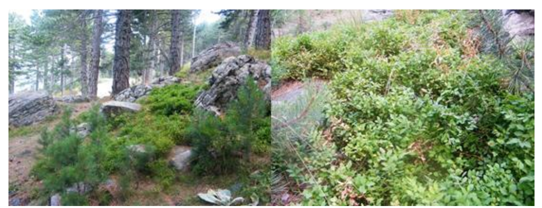
Figure 1. A view from the natural distribution area of V. myrtillus L., Mont Ida (left). V. myrtillus , L. (right)