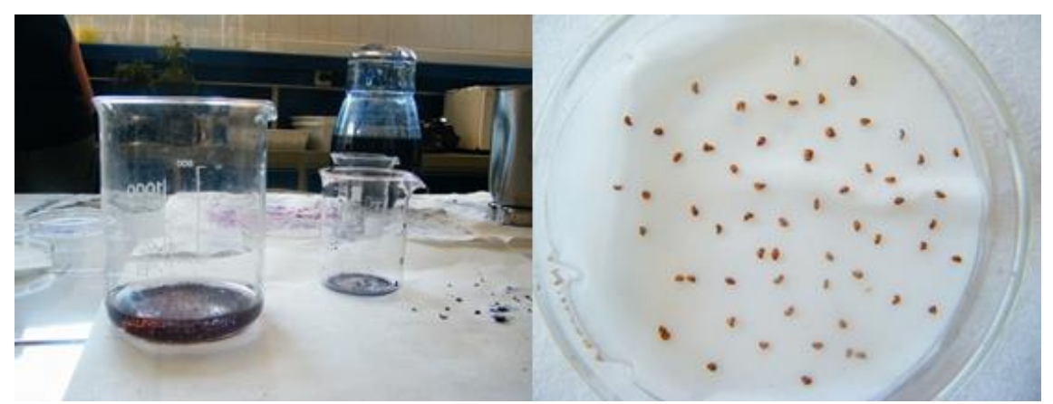
Figure 2. Application of the water floation technique to seeds of V.myrtillus L. (left). Seeds of V. myrtillus L. (right)

dried in an open container at room temperature (20-22°C) for 24 h. Seeds were placed in glass petri dishes (Figure 2, right) on 25.08.2010 and three replications of 50 seeds each were used for each test condition. The seeds were not surface sterilized.