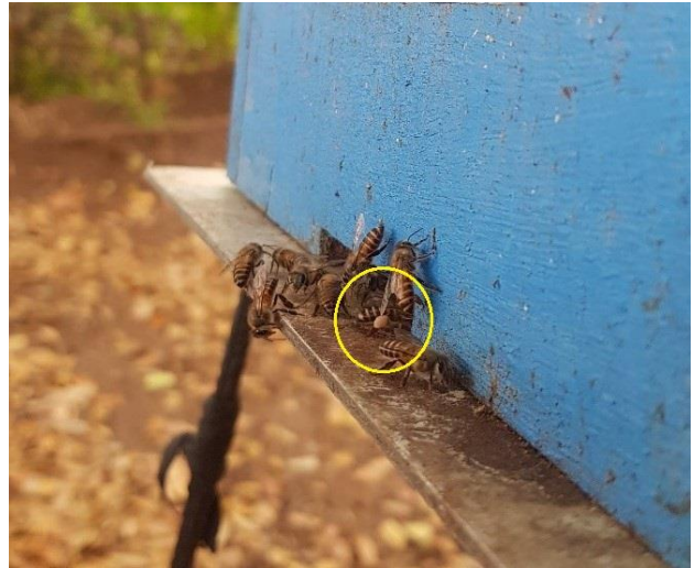
(b) Incoming forager with pollen load in corbicula