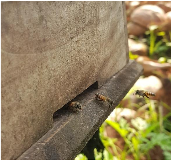
(a) Incoming nectar forager and outgoing bees