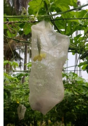
Figure 1: Sleeve cage

performed at P=0.05 levels of significance. All other calculations are performed using the MS Excel.