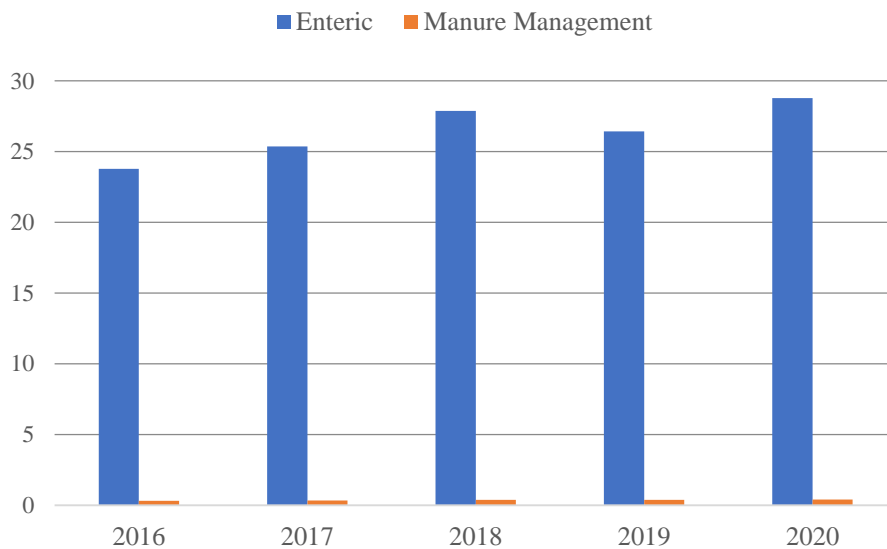
Figure 2. CH 4 emission due to enteric fermentation and manure management

The CO 2 potential generated by N 2 O and CH 4 emissions for 2016-2020 is given in Figure 3. According to Figure 3, a total of 3152000 tons of CO 2 was caused by 2813000 tons of CH 4 , and 339000 tons of N 2 O. Considering the total N 2 O potential, 86.7% is caused by direct N 2 O emissions, while 13.3% is due to indirect N 2 O emissions. 98.6% of the global warming potential due to CH 4 is due to enteric fermentation and 1.4% to the fertilizer management system. When the global warming potential is examined according to years, it has occurred mostly in 2020 and at least in 2016. From 2016 to 2020, the global warming potential due to N 2 O increased by 31.9% and the increase due to CH 4 increased by 21%.