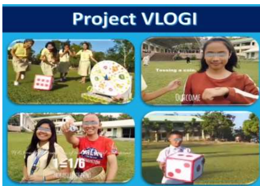
Figure 2. Project VLOGI samples used for Mathematics Instruction.

Furthermore, the researcher had also found that through Vlogs, learners could develop their 21st learning skills such as; innovation, creativity, teamwork, collaboration, ICT literacy, public speaking and presenting, critical thinking, problem-solving, artistry, self-expression, planning, and so on. These created Vlogs were a compilation from the researcher's Vlogs and the learners' project Vlogs as an intervention called project VLOGI (Video Lectures on Giving Instructions). This intervention project VLOGI was created to fill the observed gaps in the mathematical content and evaluate the impact of their participation and acceptance on this intervention. But, it may also assist teachers in developing more dynamic and interactive support instructional resources for learners to enhance and engage teaching and learning processes. Figure 2 shows the examples of this project VLOGI used for instruction.