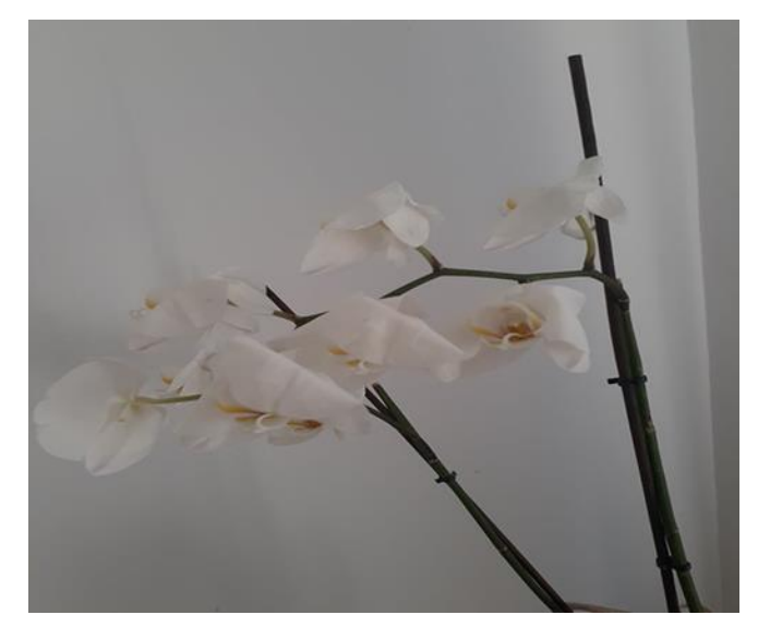
Fig.8 . "Fading like a flower" (P6)

Similar positive views were shared by P4, who was following her/his PhD studies during this period. S/he indicated that she felt lucky taking her PhD courses online without commuting to another university, one or two hours away from where she lives. On the other hand, another participant, who was trying to finish her MA thesis, stated that since the beginning of the pandemic period, s/he had faced many challenges such as difficulties in collecting data, loss of motivation, and increased workload interfering with the academic studies. Considering the experiences s/he has had as a researcher during this process, s/he used the photograph of wilted flowers to show how s/he has been feeling lately and explained her/his emotions as follows: