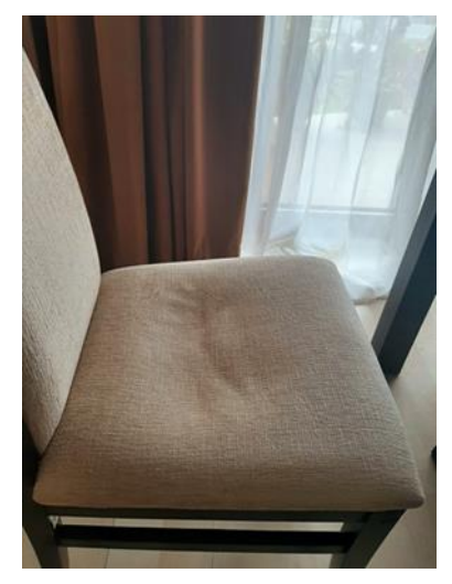
Fig.2. "Pain in the ass" (P4)

"Working from home was something we had been seeing in our coursebooks and I was like "Wow, look at these people! How flexible they are. It must be really nice to work like this..." Although the idea of "flexibility" and "working from your happy place" sounded quite charming at the beginning, I later realized that it was only the honeymoon stage. Similar to the feeling you get when you sit on a comfy chair, you get the sense of comfort and flexibility only at the beginning. Then, with all the tensions, difficulties, challenges, the unknown and the uncontrollable, you lose the sense of work-life balance and it turns into a real trouble, or pain in the ass" (P4).