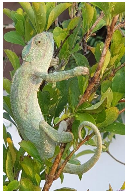
Fig.16. "Pigmented Lives" (P5)

The extract above shows that adaptation to online teaching and using online tools took and required some time, energy, practice, and collaboration, but eventually, teachers managed to survive and even enjoy the whole process despite "still having the pain in their fingers." This view was echoed by another participant who referred to this adaptation process metaphorically using the picture of a chameleon. S/he stated that "teachers are like chameleons in terms of adaptation", and when it comes to online education and using online tools, "It is just a matter of getting used to them". Therefore, what teachers have done in this process was actually "immediately changing their colors when exposed to online tools and don the colors of online education just like the chameleon (P5)."