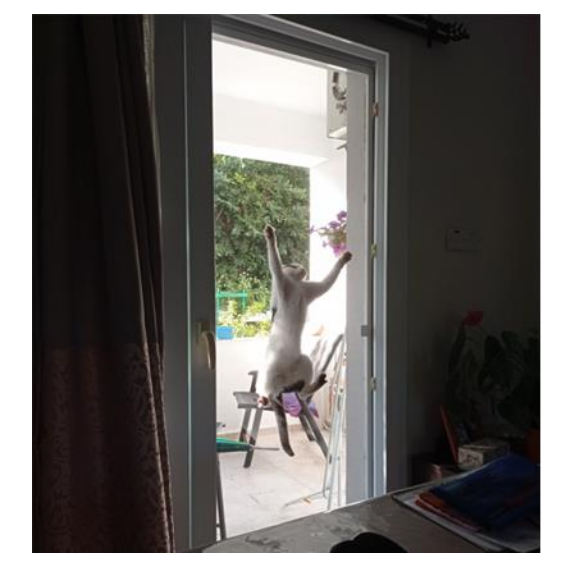
Fig.6 . "Let me in" (P3)

Despite the opportunities mentioned by some of the participants, there were also some teachers who stated their frustrations, reservations, and concerns related to their professional development during the online period. The in-service teacher trainer who took part in this study, for example, reported that s/he also had difficulties, especially during the emergency remote education, because s/he was both the one who was expected to offer support to the teachers and the one who needed help as a teacher. Having been under constant pressure by the administration to do something to help the teachers, s/he conducted a needs-analysis with the teachers to understand what they expected from the PDU during this process, sent questionnaires, held share-care sessions, and had many meetings both with the teachers and the administration. However, s/he said that s/he felt frustrated as what s/he had done was not appreciated by the teachers. The picture s/he shared along with her/his reflections explains how hard s/he tried to "get in" the teachers' professional development territory to support them as a teacher trainer.