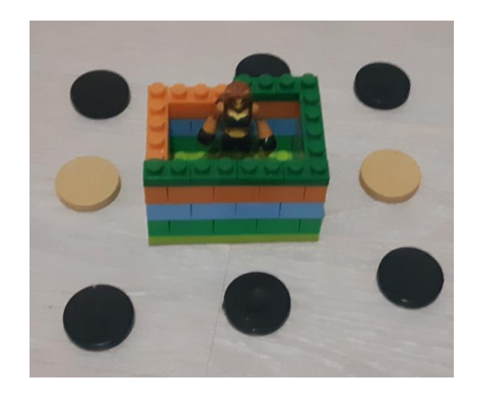
Fig.13. "Trapped in a box with very little connection to our colleagues" (P.7)

"When we were teaching face-to-face at school, we had a very collaborative, communicative and friendly environment. Therefore, going online, gave us the feeling of isolation and loneliness... it never gave the same satisfaction as it used to. This is because at school, it wasn't only about sharing materials or ideas about teaching methods. While communicating about anything, we shared moments where we laughed, got angry or even cried together. Sometimes a friend appeared at the door offering coffee just for me to take a break. I miss everything about being at school. Therefore, lacking these moments never give me the same feeling of collaboration and communication."