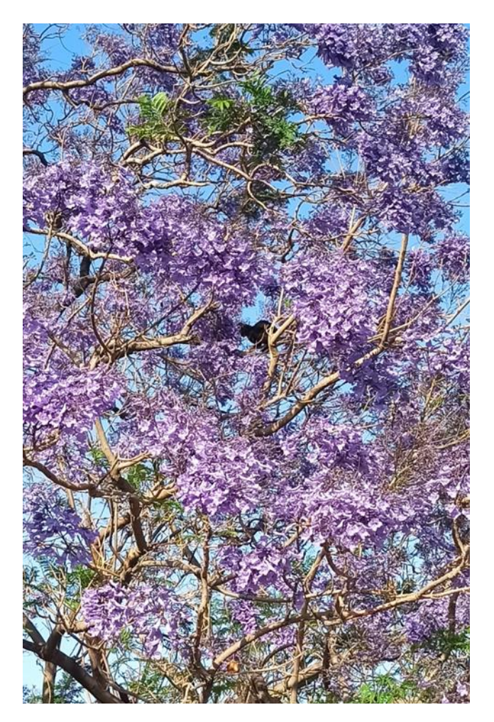
Fig.14. "To jacaranda or not to jacaranda" (P5)

Focusing on the emotional labor aspect of that situation, another participant stated s/he could not feel safe as a teacher at this institution anymore due to the uncertainties. As mentioned by other participants, too, what was expected from the administration was mostly nothing more than showing empathy by saying "We got you! You are not alone!" as noone was expecting to be provided with everything they needed in a very short time (P1).