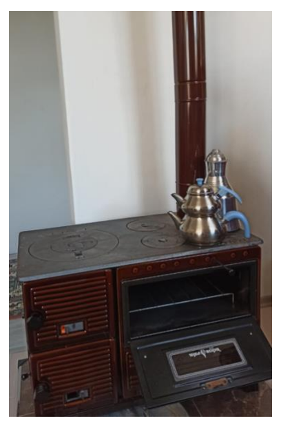
Fig.15. "Chestnut kebab" (P1)

Despite the challenges encountered, the participants pointed out that they learned a lot from their mistakes and managed to adapt to the new normal. One of the participants, for example, mentioned her/his experiences as a course leader giving examples from the exams that didn't work, the questions s/he had to cancel from the exams because of a simple mistake s/he couldn't foresee, or the tools s/he planned to use in the class but didn't work in practice. S/he said all these experiences actually turned into an advantage for the teachers as that is how they got used to being prepared for the unexpected things in the class (P1). To explain this bitter-sweet process, s/he used the picture of the stove as a metaphor and reflected on the issue of online teaching as follows: