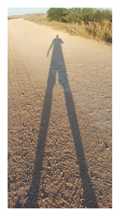
Fig.4. "As the heat declines, the shadow grows" (P5)

"The idea is that when you face challenges, you grow more. We are generally fed by the sun's energy, but when it starts to go down, I mean when things go wrong for us, we actually grow as in the picture. Suddenly, we had to face the challenge of online education, and we had to find new ways of teaching, new ways of testing, and this leads to professional development. This is professional development for me. When everything is alright, we don't feel the need to grow; you need to face some difficulties."