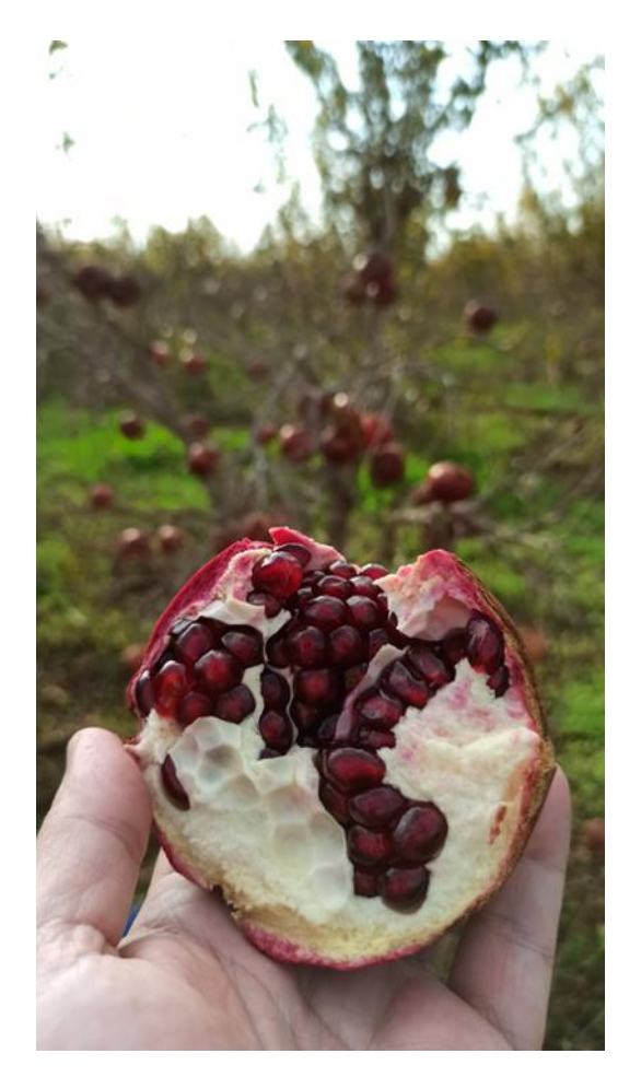
Fig.7. "The Good Red" (P5)

Regarding the academic activities during the online education process, there were both positive views or experiences and the challenges mentioned by the participants. Starting with the opportunities or benefits, one of the participants stated similar ideas with the ones mentioned in the previous theme. S/he said that thanks to online education in the Covid-19 pandemic period, new research areas became available, especially in the field of online education (tools, testing, teaching). Moreover, many universities around the world gave access to their resources for those who want to do research, and lots of online conferences, which the teachers would not have been able to attend under normal circumstances, have been held. Therefore, s/he used the picture of a pomegranate to metaphorically refer to the plenitude of the opportunities offered to the researchers or teachers trying to pursue their academic activities.