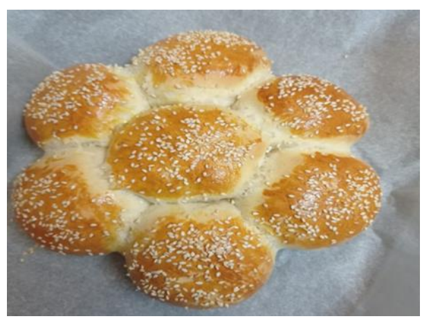
Fig.12. "I didn't think I had it in me!" (P3)

Sharing similar experiences, another participant (P3) expressed what s/he has gone through in this process in relation to collaboration among colleagues through the metaphor of baking bread with no prior experiences. S/he stated that learning new skills during the online education process was like baking bread for her/him because s/he didn't trust her baking skills beforehand, but during the quarantine, s/he managed to do that with the recipes s/he got from her/his friends as s/he felt the need and motivation to bake bread at that time. Similarly, as s/he mentioned, although s/he started online teaching with no experience in the requirements, qualification or knowledge on online education, s/he managed to learn how to navigate herself when teaching online with the guidance coming from colleagues. To express what s/he has gone through in this period, s/he stated: