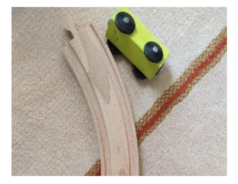
Fig.3. "Derailed" (P.2)

responsibilities is difficult enough even in face-to-face education, it is not surprising that teachers feel drained trying to manage the time to work things out both for work and for family or home. The metaphoric image of a derailed train below in Figure 3 and the abstract that accompanied it shows how a parent-teacher with administrative duties at school has been feeling during this period: