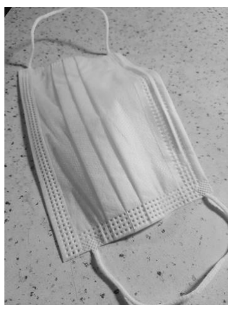
Fig.11. "The Maskeeters" (P4)

Regarding the collegial relations during the online education process, most participants agreed that it was difficult to get in touch, communicate and find a middle ground with the colleagues at the beginning during the emergency remote education process, but things got better in time. The participants stated that they had limited contact with colleagues at the beginning because no one knew what they would do, and they needed space considering the health crisis newly emerged at those times. However, as some participants mentioned, this limited contact turned into a unique collaboration among colleagues, which they did not have this much in face-to-face education. One of the participants, P4, reflected on how s/he felt at the beginning and the transition period of the collegial relations by using a mask metaphor: