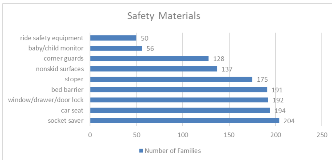
Figure 1. Safety materials that families have

This section includes practices that mothers use in their daily lives to protect children from injuries. These are classified into two categories as safety materials and safety practices.