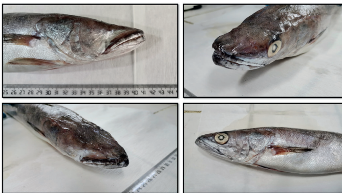
Figure 2. The abnormal specimen of European hake ( Merluccius merluccius Linnaeus, 1758).

Abnormality was recorded in one specimen of European hake in Izmit Bay. The European hake specimen was obtained from Izmit bay (Sea of Marmara), captured by fishermen during a gill-net fishery. The specimen had a normal body shape, but the right eye was missing with no injury (Figure 2). The total body length was 38.6 cm and the total weight was 492.59 g (Table 1).