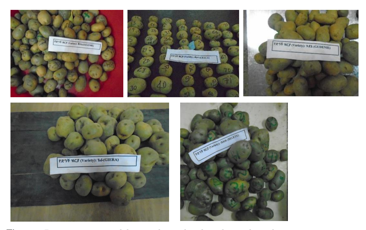
Figure 1. Potato variety used during physical and mechanical attributes measurements.

100 samples free from any injuries of dominant and popular potato varieties (Belete, Jalenie, Gera, Gudene and Chala) grown in Ethiopia were used from Holeta Agricultural Research Centers as shown in Figure 1. The samples were kept in a refrigerator at a temperature of 4°C and relative humidity of 95% for 24 hours as recommended by <u>Hurst et al. (1993)</u> to offset the effect of the environment.