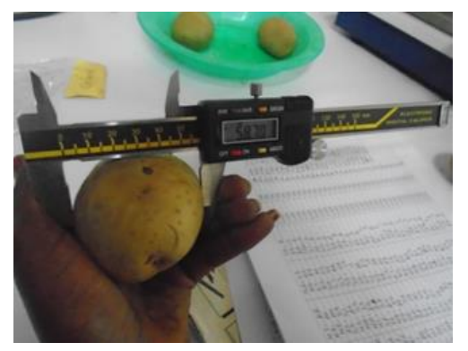
Figure 2. Measurement of principal dimensions of potato tuber.

To measure potato tuber mass digital balance with accuracy of 0.10 g was used. As shown in Figure 2, major, minor and intermediate diameters of each tuber were measured using digital caliper with an accuracy of 0.01 mm and measuring range of 0-150 mm.