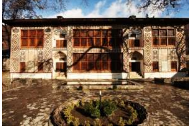
Figure 19: Sheki Khans Palace. General view.

The interiors of the Palace of Sheki Khans are marked by an extraordinary wealth of colours. The colour decision is based here upon the use of local pure tones with considerable addition of the golden colour. The wall paintings of that period were made with tempera over gesso ground causing the effect of solid enamel (Figures 20, 21).