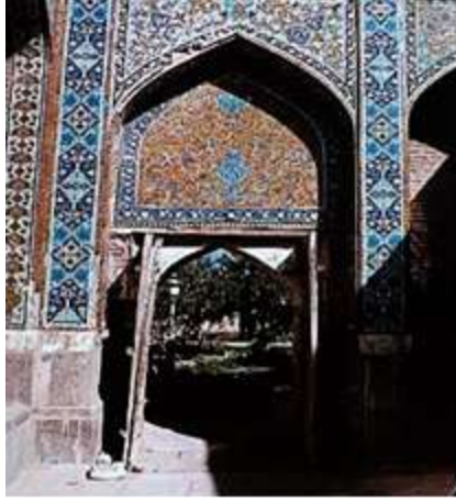
Figure 7: Ardebil complex Entrance portal. (Kajar Ch., 2003, p.133)