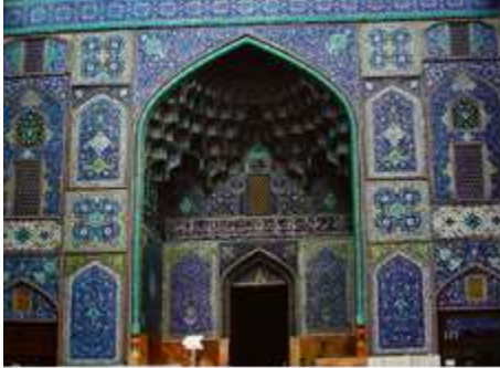
Figure 10: Isfakhan. Masjid-i Imam,1630. (Starodub T.H.,2013, p.111)

center of Isfakhan. The most important buildings here are two mosques, namely the Mosque of Sheikh Lutfullah (1602-1619) and Masjid-i Shakh (or Masjid-i Imam, 1630). These constructions, a subject of pride in the monumental art of Azerbaijan and Iran in the Sefevids epoch of mature stage, are marked by splendid decorations that witness the virtuosic skills of Sefevids masters in the art of facing with glazed tiles (Figures 10,11). The "gyolbendlik" composition is situated in the space under cupola of Lutfullah Masjidi (Figures 12,13). It is a large medallion with spiral motives and arabesques in its centre. The medallion is surrounded by 32 cupolas (this is a type of pattern - the cupola "gubpa" is a representation of the beautiful flower bud or sepal) represented in extreme detailed elaboration. As the space under the cupola becomes wider, these cupolas also become larger. The cupolas around the medallion form a united composition giving to the space under the main cupola a highly dynamic character.