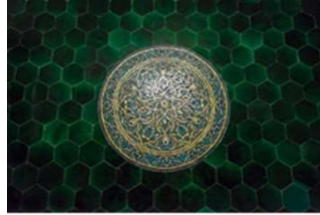
Figure 4: Bursa.Yashil Turbe ( https://www.tatilana.com/2016/03/bursa-yesil-turbe-hakkinda-bilgi.html )