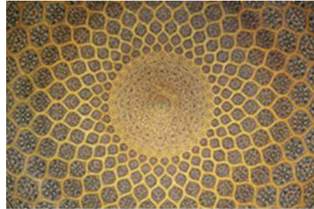
Figure 13: The cupola pattern. ( https://twitter.com/dusayla/status/972419098335473664 )

An ideal correlation between form and content, the idea and its physical representation, the whole and the part, all seem to be represented here. Everything is interlaced with each other, making one element inseparable from the whole composition. The substance seems to be intangible. It all looks