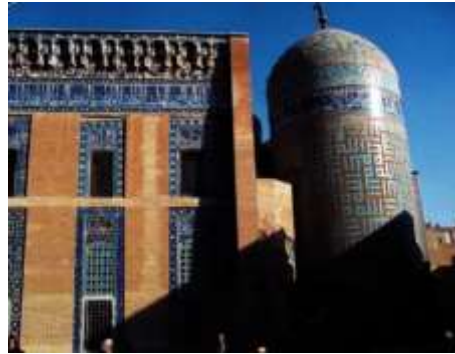
Figure 9: Ardebil complex Mausoleum Mosque.(Kajar Ch., 2003, p.135)

A special consideration should be made to the funeral mosque whose walls of are attached to the mausoleum and are richly decorated with the glazed tiles (Figure 9)