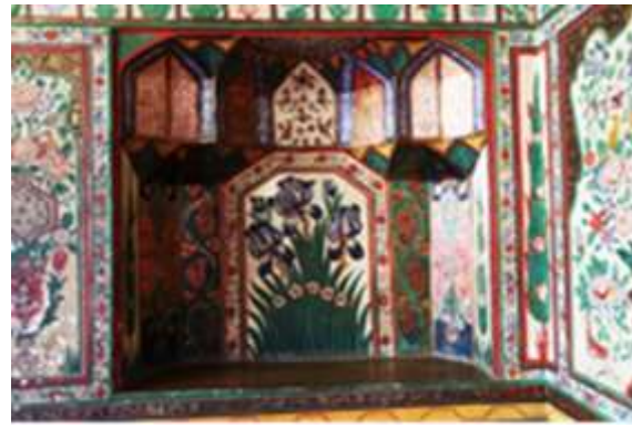
Figure 21: Sheki khans Palace. Wall murals.

Many kinds of folk applied arts are synthesized in the palace decoration. The palace interiors are filled with paintings, carving over plaster and wood, stalactite friezes, and the mystifying light transformed with varicolored “shebeke” with carpets. Evidence from contemporaries proved that carpets in the official halls and rooms are an exact reproduction of the design of the ceilings. To confirm this, one should pay attention to the interior of one of the halls in Amini imaret in Kazvin (19th c.) (Figures 22,23).