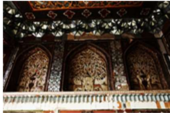
Figure 24: Shekikhanovs house, Mirror ceiling.