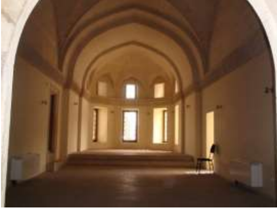
Figure 30: Shirvanshakhs Palace. Eastern hall.