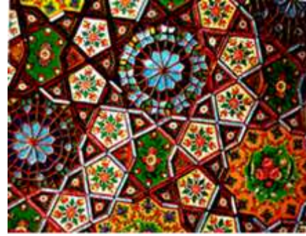
Figure 22. Amini imaret in Kazvin (19th c.). (Kajar Ch., 2003, p.198)