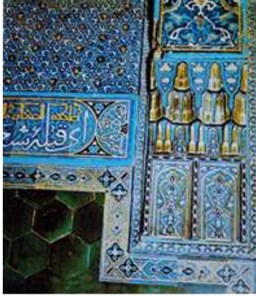
Figure 3: Bursa.Yashil Turbe ( https://www.tatilana.com/2016/03/bursa-yesil-turbe-hakkinda-bilgi.html )

of the Osman Empire. These are the Green Mosque and Green Mausoleum (Yashil Masjid and Yashil Turbe) which were considered pearls of the Turkish architecture. Both buildings were lavishly decorated with blue and green glazed tiles. According to the inscriptions on one of the walls in the Mosque, the tiles along with carved wooden doors and whole carved decoration were produced by masters from Tabriz, i.e, the Azerbaijanian (Figures 3, 4).(Miller, 1972, Soustiel, 2000).