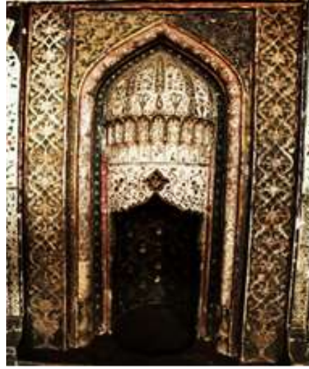
Figure 26: Shekikhanovs house. Fireplace “Bukhari”.