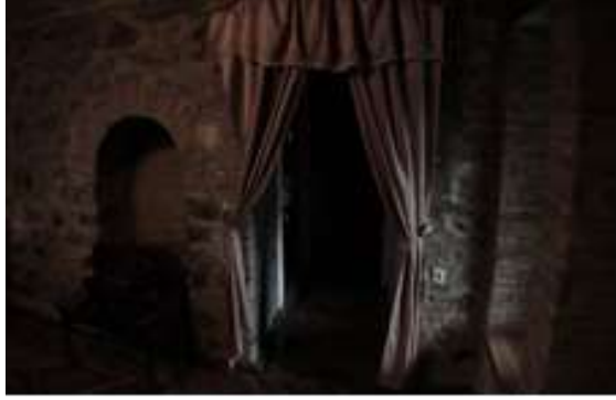
Figure 28: Sheki. Upper Caravan-Saray.