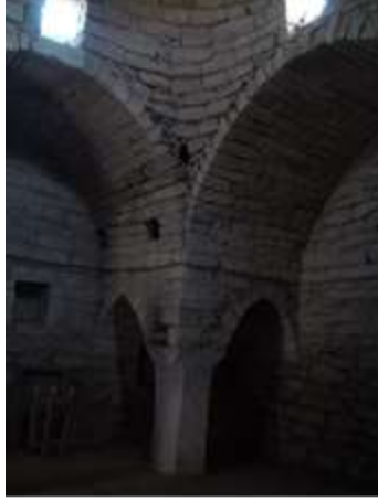
Figure14: Juma Mosque in Gala fortress (the Shirvan-Apsheron school).