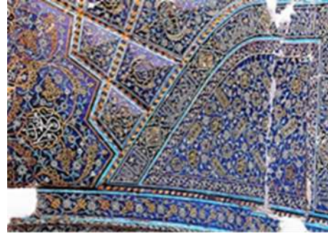
Figure 5: Tabriz.The Blue mosque (Goy Masjid, Masjed-e Kabud).(Kajar Ch., 2003, p.91)