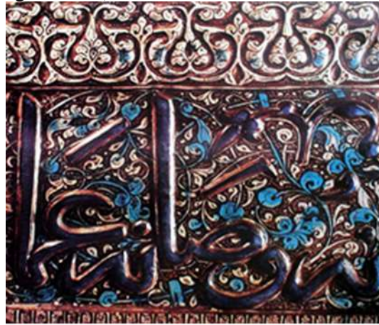
Figures 1: Khanega Pir-Husseyin on Pirsagat River, Azerbaijan, Glazed tiles (Kajar Ch., 2003,p.68)