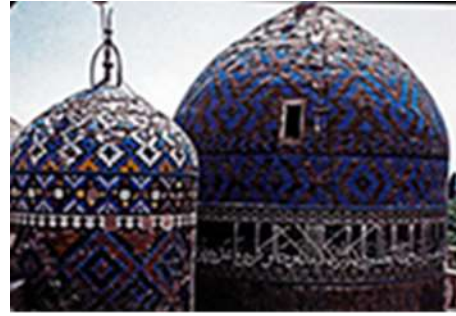
Figure 8: Ardebil complex Mausoleum. Mosque (Kajar Ch., 2003, p.135)

A special consideration should be made to the funeral mosque whose walls of are attached to the mausoleum and are richly decorated with the glazed tiles (Figure 9)