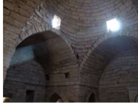
Figure15: Juma Mosque in Gala fortress (the Shirvan-Apsheron school).