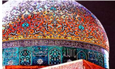
Figure 11: Isfakhan. Lutfullah Masjidi. (Starodub T.H.,2013, p.113)

The decoration of Lutfullah Masjidi has embraced almost all the traditional patterns and compositions proper to the Azerbaijan art throughout the centuries. That's why this monument is called an Encyclopedia of the Azerbaijan Ornamental Art in scholar literature (Figures 10-13) (Aliyeva K., 1999).