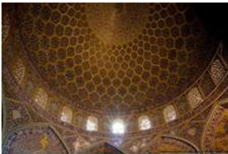
Figure 12: Isfakhan. Lutfullah Masjidi Dome "gubpa" ( https://gracetheglobe.wordpress.com/2013/11/18/the-sheikh-lotfollah-mosque-isfahan-iran/amp/ )

The decoration of Lutfullah Masjidi has embraced almost all the traditional patterns and compositions proper to the Azerbaijan art throughout the centuries. That's why this monument is called an Encyclopedia of the Azerbaijan Ornamental Art in scholar literature (Figures 10-13) (Aliyeva K., 1999).