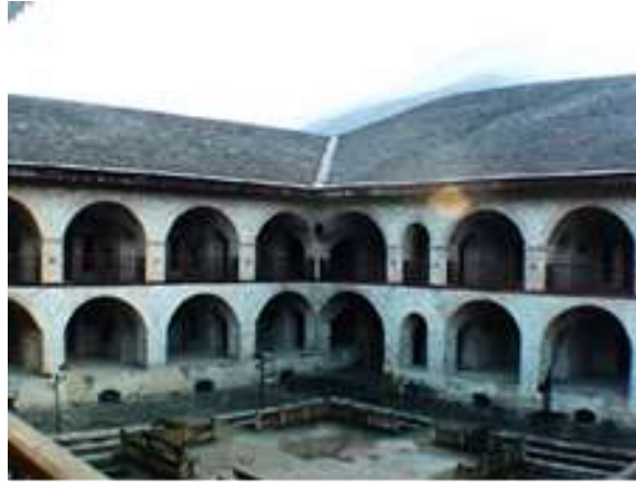
Figure 27: Sheki. Upper caravan – saray.

In some types of constructions, the interiors were decorated using expressive possibilities of construction materials such as limestone, brick and cobble-stone, along with an arrangement of sources of natural light. An interesting example of this is Upper Caravan-Saray in Sheki which dates back to the 17th c. (Figure 27).