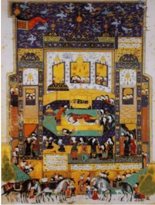
Figure 16: “Shirin's suicide” (The Royal Turkoman “Hamse” by Nizami, 1505, Tabriz). (Kajar Ch., 2003, p.147)

image of the two-storeyed structure of the space consisted of colored screens decorated with geometric patterns. The lower part of the walls is decorated with geometric patterns imitating some kind of border, while the upper part of the walls is covered with stylized floral ornamentation or figured composition (in our case it is an image of Paradise with walking gazelles). There are niches in the walls containing the china ware, use of the architectural ornament, imitation of the glazed tiles. All this attracts the attention to the perfect correlation of the colour combinations. In spite of the obvious conventional character of the language in these examples (which is typical for the medieval eastern miniature as a whole), one can surely assume the existence of a certain prototype for such an interior. Many details similar to what can be seen in other pieces of architectural monuments and applied arts survive.