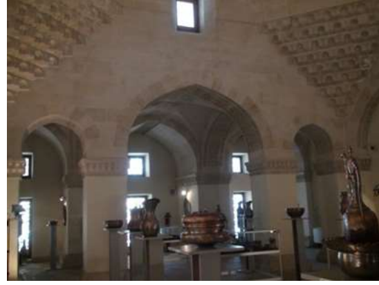
Figure 31: Shirvanshakhs Palace. Main hall.

The inner treatment of the walls is extremely laconic. The architectural divisions indicating the scale of the building are marked in relief. Solemnity of the palace view is emphasized by the absence of decoration and ascetic character of masonry stressed with loophole shaped apertures. The palace as a whole looks like a fortress. The individual volumes are characterized by perfect proportions and high quality masonry. Nevertheless, it is obvious that such a laconic, somehow sterile stony interior was vivified by the presence of carpets, mutacas, lighting fittings and other attributes of traditional handcrafts which effectively set off the beauty of masonry with their bright colors. It is important to emphasize that the distribution of light sources on the walls and cupolas play a most significant role in the artistic expressiveness of these interiors.