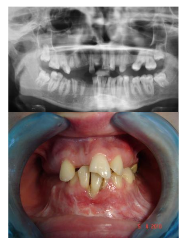
Figure 1. Orthopantomogram and oral view of the patient before treatment

In the bite occlusion, upper and lower alveolar ridges were in contact on the right side and lower posterior teeth were in contact with the upper alveolar ridge on the left. There was only 1 mm freeway space. Because of the patient's depression; she had no demand or tolerance to invasive treatments.