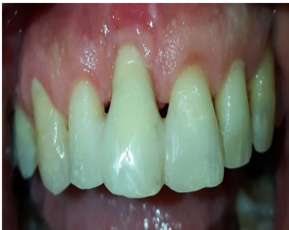
Figure 4. Clinical photograph of patient at 36 th month