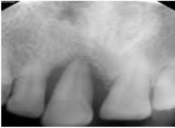
Figure 1. Baseline radiograph