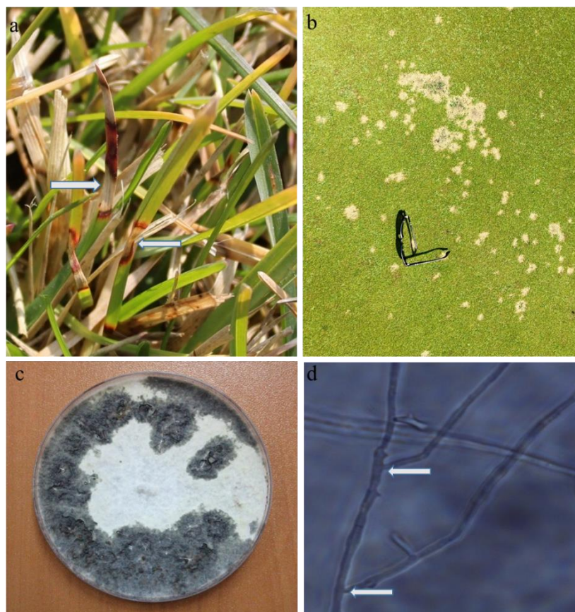
Figure 1. Sclerotinia homoeocarpa : symptoms on leaves on 'Rough' area (a) 'dollar spot' symptoms on 'Green' area (b) in a golf course, colony appearance on PDA (c), 'Y-shaped branching' on hypha (d)

During the survey phase of the study, a total of 62 samples were collected from 13 golf courses in 5 provinces in Turkey. As a result of isolations from leaves that have cream color blotches surrounded by dark red color (Fig. 1a) and from plants on small yellowed circular patches (Fig. 1b), seven S. homoeocarpa isolates were obtained that was based on both colony morphologies and rDNA internal transcribed spacer (ITS) region sequences (Table 1). The colony color of all isolates on PDA was initially white but after 7-10 days became black-white color (Fig. 1c). 'Y-shaped branching' in fungus hyphae was observed (Fig. 1d) on a light microscope.