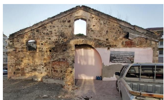
Figure 8. The view of Azize Paraskevi Church from the east wall on Yalova Street