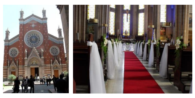
Figure 1. Saint Antuan Church under conservation, Istanbul

Gothic style is used for tourism purposes as well as its original function (Atıcı and İnceoğlu, 2020) (Figure 1).