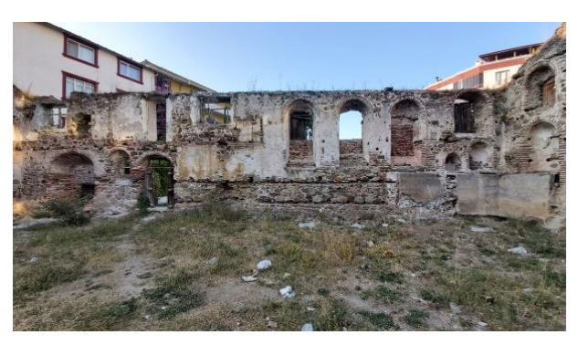
Figure 11. Apertures in the north wall of Azize Paraskevi Church

The church structure is mostly made of stone material. However, there is also the use of bricks under the eaves of the roof, in the arches above the window and door openings, and at various points on the walls. The wall thicknesses of the building, which was built with a masonry system, vary between approximately 82-93 cm.