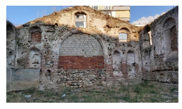
Figure 10. The apse and niches of Azize Paraskevi Church

The church structure is in a very dilapidated condition today. There are few elements of the building in its interior. These can be listed as niches, apses, windows and doors (Figure 10, Figure 11). No items that could be associated with this building were found in its surroundings. New residences continue to be built in the immediate vicinity of the building. However, many unqualified buildings adjacent to the site were removed.