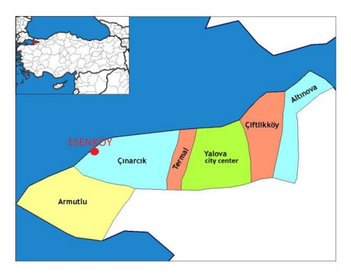
Figure 5. Location of Esenköy in Yalova (Prepared by using URL 4)

Esenköy is a town in the Çınarcık district of Yalova province (Figure 5, Figure 6). Located on the shores of the Marmara Sea, the settlement has hosted users of Greek origin for many years in the past. Muslim families of Caucasian and Laz origin settled in place of the Greeks who had to leave the settlement with the population exchange. This situation has brought socio-cultural and economic changes in Esenköy (URL 3).