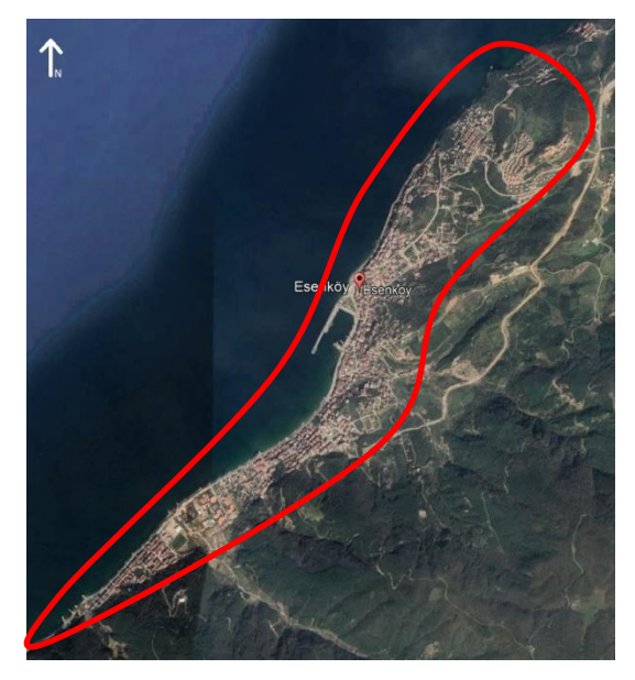
Figure 6. Aerial photography of Esenköy

In Esenköy, both before the exchange; it is known that there are monumental structures and houses built with traditional methods after the settlement of Muslim users. However, most of them have been lost before reaching the present day. Azize Paraskevi Church, which has not been lost yet but is in a very neglected condition, has qualities worth examining as one of the oldest monumental works in the settlement. Only the exterior walls and some interior elements have survived from the church building, which is located on Yalova Street, at a central point of the settlement (Figure 7, Figure 8).