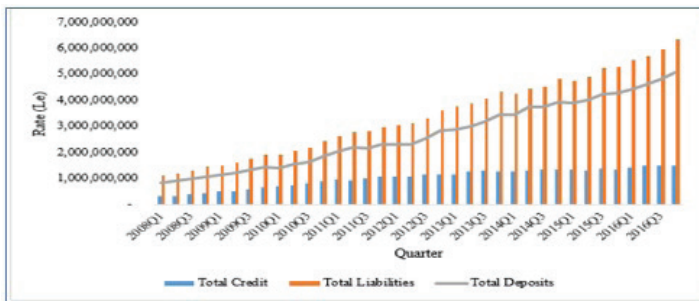
Figure 1. Trend in Deposit, Credit and Liabilities

More recently, there has been a surge in commercial banks in the country, with two of them being state-owned, notably the Rokel Commercial Bank (RCB) and Sierra Leone Commercial Bank (SLCB), which commenced operation in the year 1973. In addition, the post-civil crisis has ushered influx of foreign-owned banks, particularly from the West African Sub-region. However, despite the growth in banking operations, the financial system has experienced credit crises because of lapses in managing deposits and loan issuances. Figure 1 below provides evidence of banks' total liabilities against total credit in the system, indicating Non-Performing Loan (NPL) crises the banking industry experienced over the period.