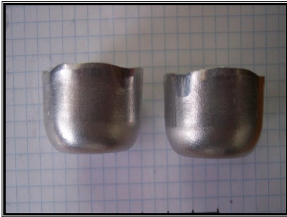
Figure 3. Earing test results.