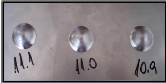
Figure 1. Erichsen test results

compare the results, there different curves were plotted in the same figure.