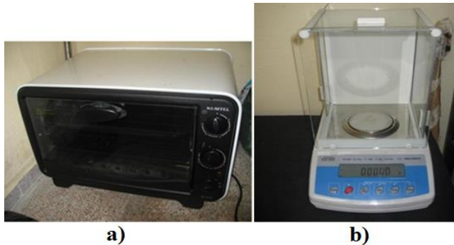
Figure 1. a) Drying oven, b) 10-4 gr Precision weighing device

hyaluronate fluid on the ball-disk test apparatus. After the test, the samples were cleaned with ethanol and weighed to determine the mass losses. The abrasion tests were carried out at room temperature and under normal atmospheric conditions in a dry and rubbing environment with sodium hyaluronate liquid. The 100Cr6 balls used for the test were brought into contact with the disc so as to make a separate trace for each experiment. After the studies in the dry environment, 0.5 liter sodium hyaluronate liquid was added with the aid of the tank included in the system and the same experiments were carried out in the liquid medium. All experiments were repeated three times and averaged.