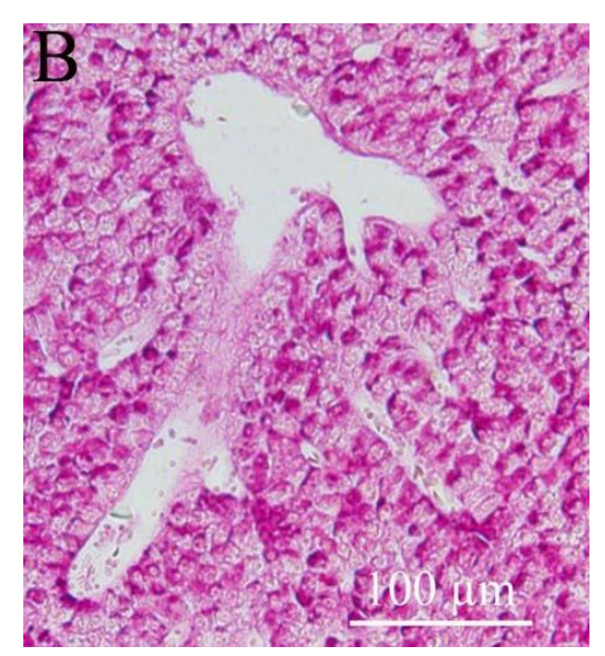
Figure 1. Glycogen content in the liver of Calcalburnus tarichi A) Control and B) E2 treatment group. (PAS).